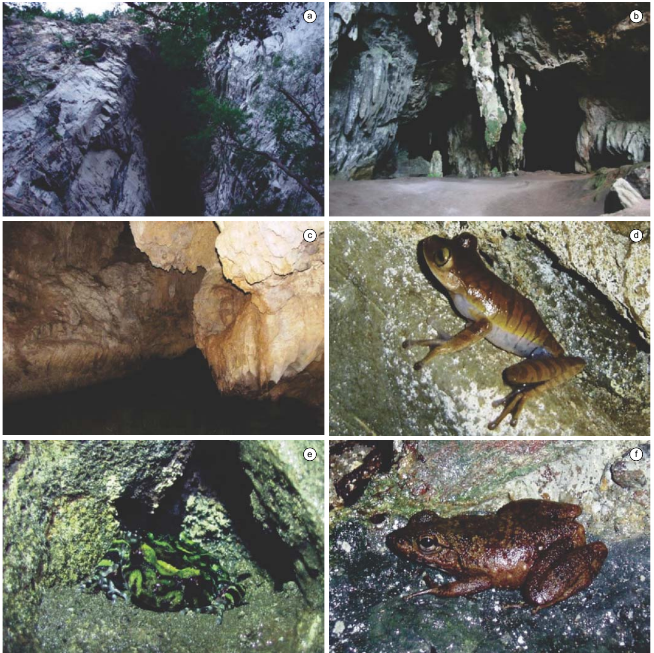
Figure 4. Caves sampled at the Parque Estadual Turístico do Alto Ribeira (PETAR), Iporanga municipality, São Paulo State, Brazil: Casa de Pedra cave, Núcleo Casa de Pedra (a); Morro Preto cave, Núcleo Santana (b); Couto cave, Núcleo Santana (c). Amphibian species observed in caves at the PETAR: Bokermannohyla hylax inside Chapéu Mirim II cave, Núcleo Caboclos (d); Cycloramphus eleutherodactylus inside Cafezal cave, Núcleo Santana (e); Hylodes cardosoi inside Chapéu Mirim I cave, Núcleo Caboclos (f).