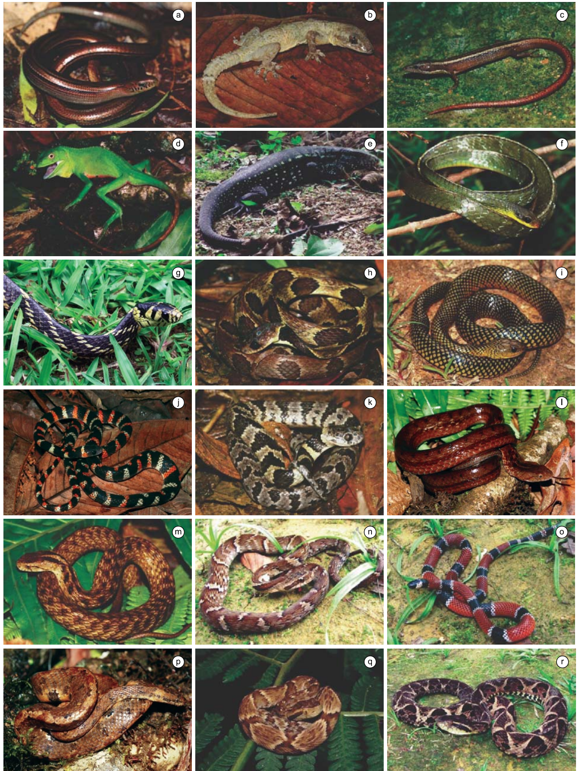
Figure 3. Reptile species sampled at the Parque Estadual Turístico do Alto Ribeira (PETAR), São Paulo State, Brazil. a = Ophiodes striatus ; b = Hemidactylus mabouia ; c = Placosoma cordylinum champsonotus ; d = Enyalius iheringii ; e = Tupinambis merianae ; f = Chironius bicarinatus ; g = Spilotes pullatus ; h = Dipsas alternans ; i = Liophis miliaris ; j = Oxyrhopus clathratus ; k = Sibynomorphus neuwiedi ; l = Thamnodynastes nattereri ; m = Tomodon dorsatus ; n = Xenodon neuwiedii ; o = Micrurus corallinus ; p = Tropidophis paucisquamis ; q = Bothropoides jararaca ; r = Bothrops jararacussu. All individuals were found at the study locality.