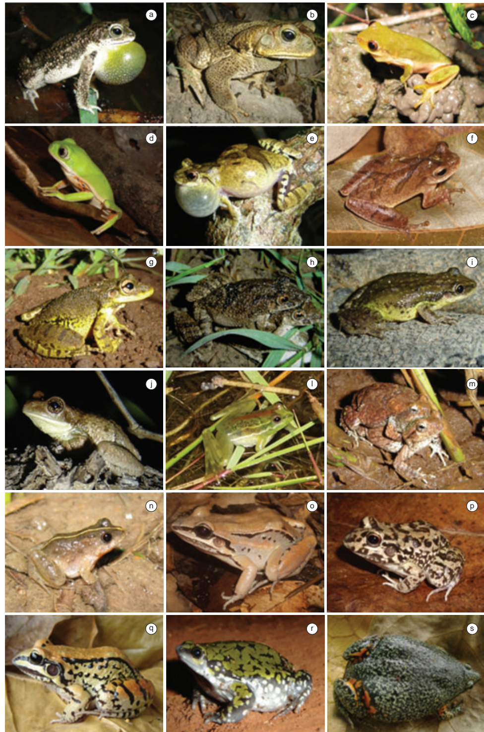
Figure 4. Some of the anuran amphibians recorded at Fazenda Baía da Pedra, northern Pantanal, Cáceres municipality, Mato Grosso state, Brasil. a) Rhinella major ; b) Rhinella schneideri ; c) Dendropsophus cf. elianae ; d) Phyllomedusa azurea ; e) Dendropsophus melanargyreus ; f) Dendropsophus minutus ; g) Scinax fuscovarius ; h) Scinax acuminatus ; i) Scinax nasicus ; j) Trachycephalus venulosus ; l) Pseudis limellum ; m) Eupemphix nattereri ; n) Pseudopaludicola sp.; o) Leptodactylus elenae ; p) Leptodactylus bufonius ; q) Leptodactylus mystacinus ; r) Dermatonotus muelleri ; s) Elachistocleis cf. magnus.

Figura 4. Fotografias em vida de espécimes de anfíbios anuros registrados na Fazenda Baía de Pedra, Pantanal norte, município de Cáceres, Mato Grosso, Brasil. a) Rhinella major ; b) R. schneideri ; c) Dendropsophus cf. elianae ; d) Phyllomedusa azurea ; e) D. melanargyreus ; f) D. minutus ; g) Scinax fuscovarius ; h) Scinax acuminatus ; i) S. nasicus ; j) Trachycephalus venulosus ; l) Pseudis limellum ; m) Eupemphix nattereri ; n) Pseudopaludicola sp.; o) Leptodactylus elenae ; p) L. bufonius ; q) L. mystacinus ; r) Dermatonotus muelleri ; s) Elachistocleis cf. magnus.