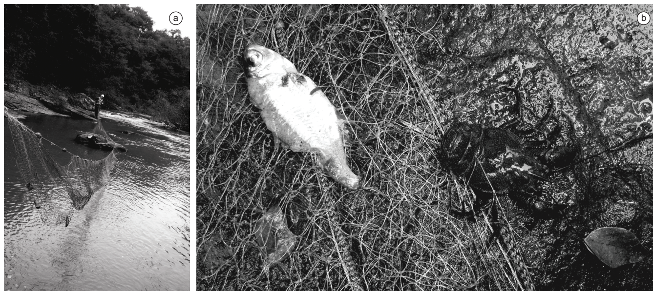
Figure 1. Fish and by catch capture. (a) Gill net pickup. (b) The fish Astyanax fasciatus and the aeglid Aegla singularis entangled in the gill net. Note that the fish suffered many bites.

A total of 37 individuals of A. fasciatus , 14 of Crenicichla sp. and 21 aeglids were obtained from two places. Eleven individuals (29.3%) of A. fasciatus showed signs of carnivory by aeglids, while in Crenicichla sp. a total of five individuals (35.7%) showed attack by these aeglids. During the net removal from the water only a few aeglids remained attached to it: most of them have loosened from the fishes and fell down back into the water (Figure 1). It is supposed