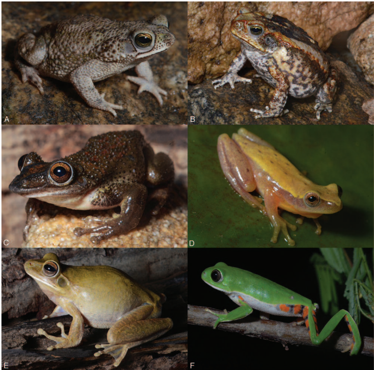
Figure 3. Anurans registered at the Middle Jaguaribe River region, Ceará State, northeastern Brazil: A = Rhinella granulosa (AAGARDA 10216); B = Rhinella jimi (AAGARDA 10292); C = Corythomantis greening (AAGARDA 10391); D = Dendropsophus nanus (AAGARDA 10276); E = Hypsiboas raniceps (AAGARDA 10404); F = Phyllomedusa nordestina (individual not collected).