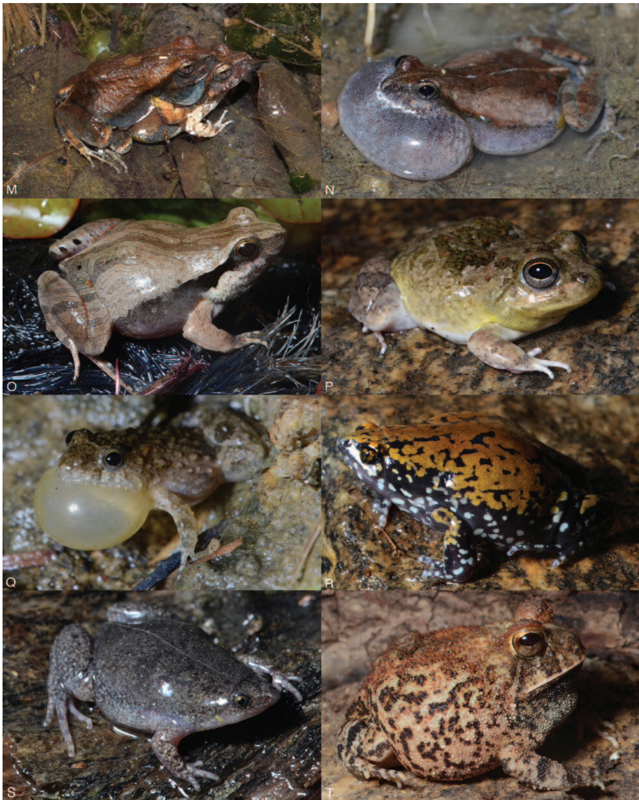
Figure 3 (continued). Anurans registered at the Middle Jaguaribe River Region, Ceará State, northeastern Brazil: M = couple of Physalaemus cicada (AAGARDA ); N = Physalaemus cicada (AAGARDA 10329); O = Physalaemus cuvieri (AAGARDA 10394); P = Pleurodema diplolister (AAGARDA 10349); Q = Pseudopaludicola pocoto (AAGARDA 10335); R = Dermatonotus muelleri (AAGARDA 10209). Anurans registered at the Middle Jaguaribe River region, Ceará State, northeastern Brazil: S = Elachistocleis piauiensis (AAGARDA 10251); T = Proceratophrys cristiceps (AAGARDA 10401).