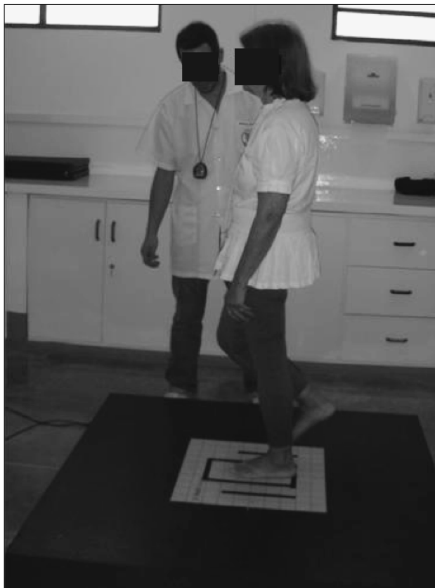
Figure 2. Subject's position on the force platform (model BIOMECH400) during one-leg standing for balance test.

Mean values with standard deviation (SD). a Tshortest: performance score of functional agility/dynamic balance test. Tlimit: performance score from traditional one-leg stance test. Time of force platform: time values from time-series data of force platform, ranging from 0.5 to 30 seconds. *Student's t -test between Tlimit and time values from force platform. No significant difference was found between the two tasks.