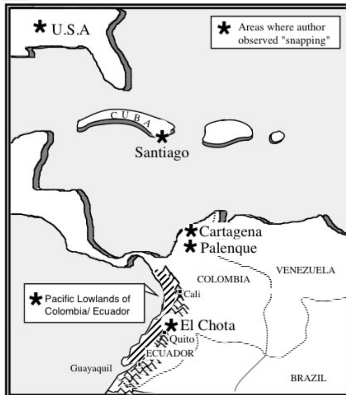
Map 1: Areas where the author witnessed snapping

contact during colonial times (Del Castillo 1997), which explains in part why their Spanish dialects and “popular” speech styles are so similar.