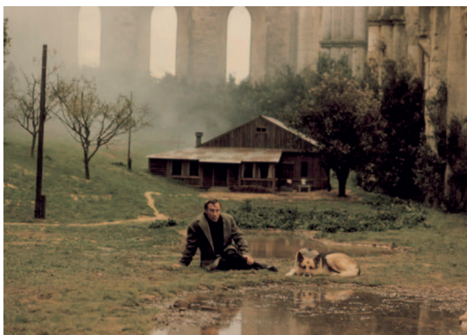
Illustration 10: The ending shot of Nostalghia .

Nostalghia is about exile, and was made in exile. A Russian poet, Gorchakov (Oleg Yankovsky), travels through Italy, accompanied by his guide and translator Eugenia, researching the life of an 18 th century Russian composer. They arrive in a small spa town, said to have been a favourite place of saint Catherine of Sienna, and go to the hotel.