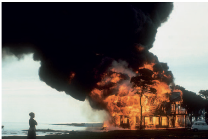
Illustration 9: Leaving everything behind.

Nostalghia is about exile, and was made in exile. A Russian poet, Gorchakov (Oleg Yankovsky), travels through Italy, accompanied by his guide and translator Eugenia, researching the life of an 18 th century Russian composer. They arrive in a small spa town, said to have been a favourite place of saint Catherine of Sienna, and go to the hotel.