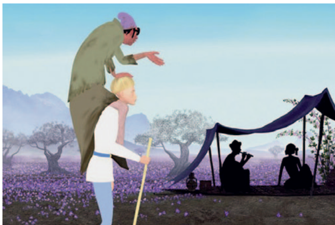
Illustration 4: Azur and Crapoux near the medina.

discouraged by the hostile attitude of the locals, who consider that his blue eyes bring misfortune, and decides that the world is ugly and that he will never open his eyes again. He will be blind. As a consequence, he needs someone to guide him. This person is Crapoux, a compatriot who has spent twenty years in the country, while remaining a foreigner.