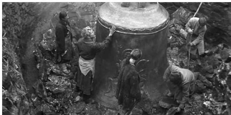
Illustration 1: The young bell maker and his companions.

seems to know much more about local customs, people and events than the other Italian.