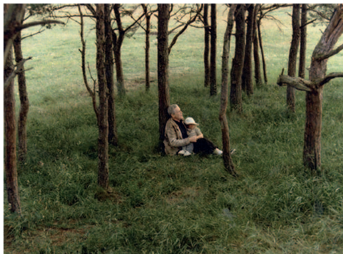
Illustration 8: Words, words, words.

Multilingualism is present right from the start in Andrei Tarkovsky's last film. Two titles, Offret and Sacrificatio , are displayed simultaneously on Leonardo Da Vinci's "Adoration of the Magi", on the background of music by Johann Sebastian Bach. But mistrust of human language is also expressed very early in the film, in the form of a quotation from Hamlet : "Words, words, words". Hamlet gives this reply to Polonius, who wanted to know what the prince was reading. In Offret , whose English title is The Sacrifice , it is Alexander (Erland Josephson) who says this, in one of his monologues, as he wanders around accompanied by his mute son. Alexander speaks a lot, and the child listens.