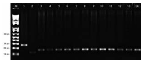
Figure 4. Agar gel (1.5%) for the PCR of the \alpha -Tropomyosin gene in (1) Pacu, (2) Pirapitinga and (3) Tambacui, and of specimens obtained from a fish farm in Santarém, Pará (Brazil) (4-13). M = 1Kb Plus DNA Ladder.

Only 23 of the fishes were identified as hybrids by the persons who supplied the specimens, whereas the combined analysis of the mitochondrial Control Region and the nuclear \alpha -Tropomyosin