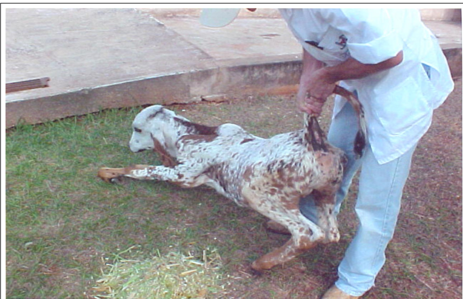
Figure 1 - A Gir calf, with a weaver syndrome like condition, trying unsuccessfully to stand up with help.

findings include loss of the Purkinje cells (DE LAHUNTA, 1990); hereditary neurodegeneration, but it is a recessive mutation linked to the sex, occurring only on males (GEORGE, 2002); calves's hereditary ataxia, but histological examination reveals aplasia of the cerebellum neurons (GEORGE, 2002).