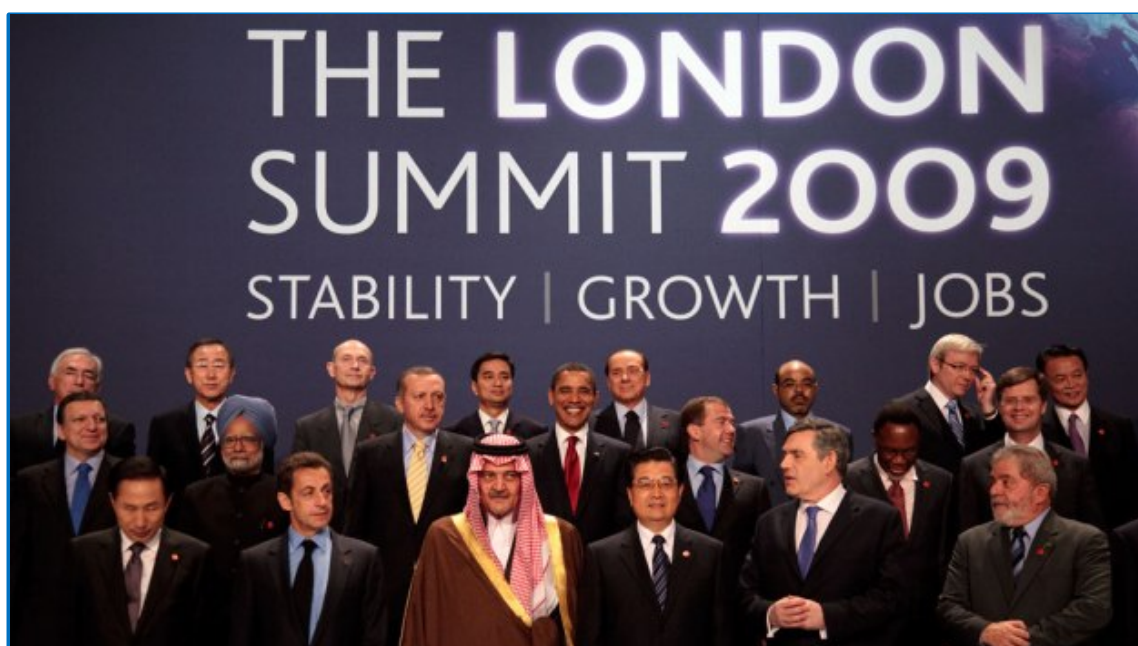
Image 6. G-20 Meeting in London, a group formed by leaders of 19 countries with the largest economies plus the European Union 17 .

The first of these international meetings is that of the Progressive Governance Summit, held in March 2009 in Viña del Mar, Chile. In this post, the Democrat Vice President Joe Biden poses smiling at the center, accompanied by heads of State from Brazil, the UK, Norway, Argentina, Spain, and Uruguay 18 . The next meeting to be registered is the G-20 meeting in April 2009, in London. In this post (Image 6), the Brazilian and U.S. Presidents are with the other heads of State, preparing for the official photo of the event. Barack Obama smiles at the center, surrounded by the leaders of the other countries; the Brazilian President is at the lower right corner. The publication on Flickr provided, among other hypertextual links that are unavailable for access, a link to a post in English on the White House blog 19 . In it, a video is available with the full speech by Barack Obama during the event and some textual clippings of speeches by the U.S.