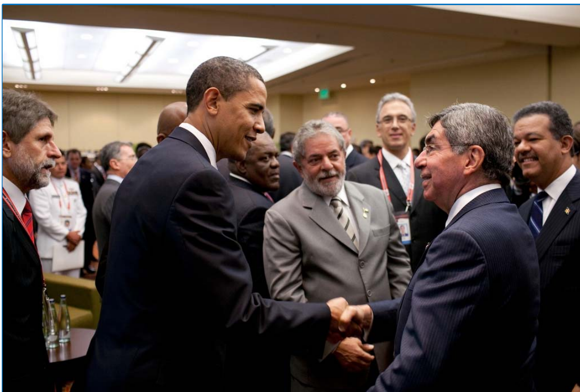
Image 7. Presidents Obama, Lula, and Arias at the Summit of the Americas in Trinidad and Tobago 21 .

image, observing the handshake between the U.S. and the Costa Rican Presidents. The Brazilian president is included as a mediator of the relations between the United States and Latin America.