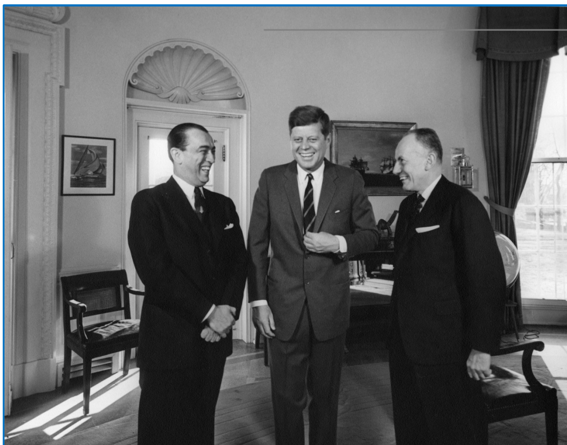
Image 4. The good-humored John F. Kennedy welcomes former Presidents Juscelino Kubitschek (Brazil) and Lerras Camargo (Colombia) in the White House in December 1962 11 .

President John Kennedy always occupies the center of photographs and he is usually smiling, having friendly conversations with politicians and diplomats. The U.S. President is also highlighted by his way of dressing, such as in Image 4: he appears in the album using clear and uncluttered suits - his shirt can be seen - while the others wear closed and dark suits. The set of images of John F. Kennedy used in this memory of bilateral relations refers to a young and good-humored President who gets on well with governors and the Brazilian bureaucratic body. It also refers to someone who knows the Brazilian problems and is able to discuss them with experts, such as Celso Furtado. The halls of the White House, the official residence of U.S. Presidents and symbol of the Federal Power, emerge as the space where these friendly bilateral meetings take place.