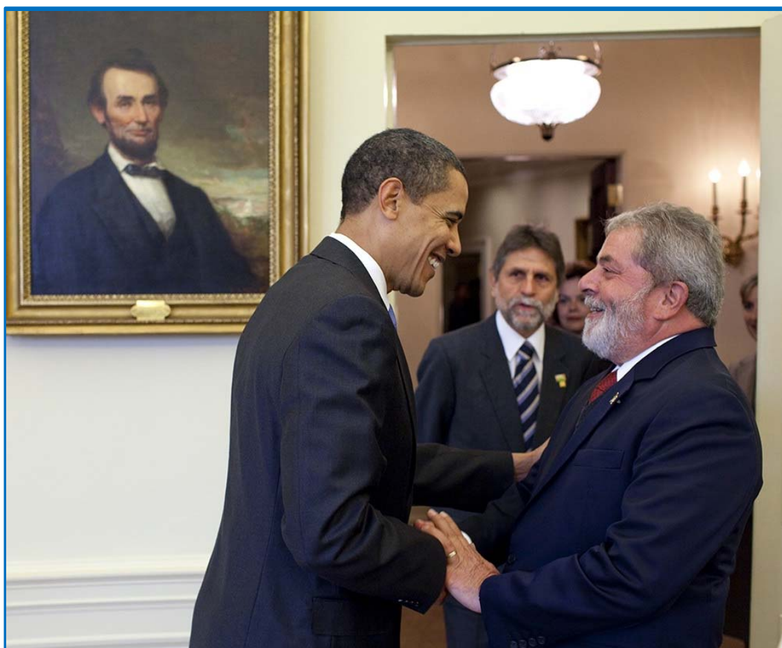
Image 1. Barack Obama greeting the then Brazilian President, Luiz Inácio Lula da Silva 4 .