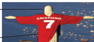
Figures 8 and 9: Magazine A Bola Mundial 2014