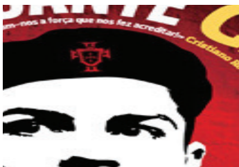
Figure 5: Ronaldo's beret

coherence. In fact, Ronaldo is wearing Che Guevara's military beret, his trademark as a revolutionary leader, explicitly (re)constructing Ronaldo as the Commander of the Portuguese team, since his beret is branded with the logo of the Portuguese Football Federation.