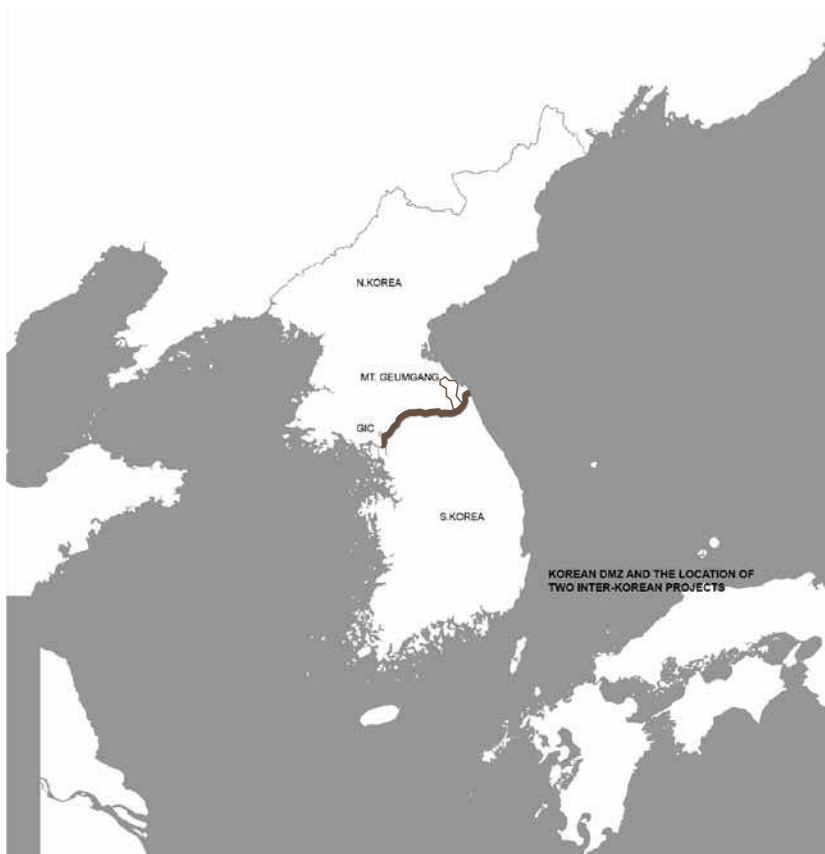
Figure 2. Location of DMZ and two inter-Korean Projects