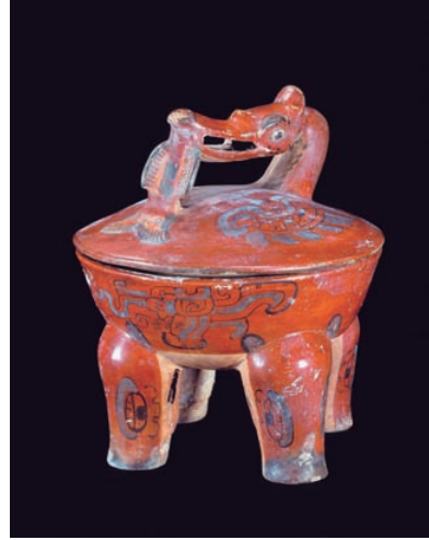
1. Basal Flange Bowl Bird Tetrapod.

Nevertheless, at least for Classical Greek art, the traditional notion that the monumental is more important than the small-scale and hand-held has depended on the survival of named painters and perhaps on the wealthy contexts of their work, as well as the complex social relations created by the scale of works that allow public viewing. Generations of viewers and pilgrims observed the paintings by Polygnotos at Delphi; both Pliny and Pausanias commented on subject, style, and significance. Modern scholars generally believe that the vase painter Polygnotos took not only his name but also his monumental style from the wall painter. 4 For the Moche, the revelation of recent years has been the very notion that the imagery painted (and sculpted, for many Moche pots depend keenly on the integration of the two media) on vessels conforms to a larger mythic sequence (fig. 2), known in its most monumental form in wall paintings at Huaca de la Luna and Pañamarca 5 and in its greatest complexity in vase painting. 6 However, as further revealed at Sipán, the subject of painting