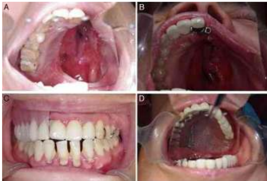
Figure 1 (A) Image before definite rehabilitation; (B) view of try-in of the fixed part; (C and D) view of the definite prosthesis with stud attachment.

our reports, the function of obturator was enhanced when adding attachment reported by other investigators. 27 The retention of conventional prostheses mainly depends on setting various clasps to healthy abutment; and the stability gained from remaining teeth and bone. But clasps have a horizontal force instantaneously to abutment teeth caused by cycles of insertion/removal, and may lead to chronic periodontal damage inevitably. 28 Thus the tooth adjacent to the defect suffered many overburden outside forces, resulting in rapid periodontal damages of the tooth. For delivering