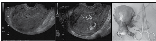
FIGURE 2 – Gynecologic ultrasound image and surgical specimen of the clinical case (Hospital Prof. Dr. Fernando Fonseca, Amadora, Portugal)

Immunohistochemistry, by means of markers as human leukocyte antigen G (HLA-G), cluster of differentiation 10 (CD10),