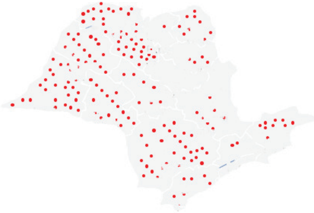
Figure 3. Map of the Diffusion of PGRM – São Paulo (1999-2001)