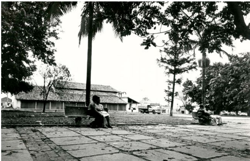
Couple in Padre Aleixo Square, with a side view of São Miguel Chapel. 7