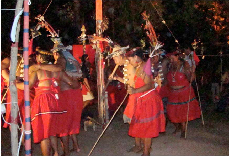
Doc 37: An outdoor turé dance at the inauguration of the exhibit at the Museu do Índio, Rio de Janeiro in 2007.