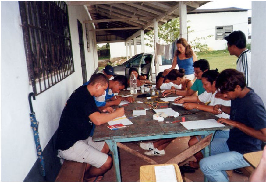
Doc 9: Training workshop in the Parochial House in Oiapoque.