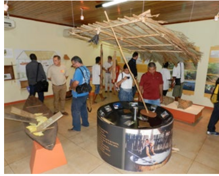
Doc 44 – 45: – Visitors from Brazil, French Guyana, Surinam and Guyana at the inauguration of the exhibit on manioc fields and cassava.

activities, small workgroups were formed among the museum employees (who themselves are farmers in their communities, when they are on vacation) and the participants from the villages, who are fulltime farmers and recognizably better informed about the practices involved in the production of a variety of agricultural products. The information provided by these farmers caused admiration and respect. On the other hand, the museum employees, who are younger, better trained for research and the museographic activities such as registration and documentation, helped the indigenous people from the villages to record their talks by transcribing and translating narratives and myths, and typing and organizing the data, which pleased the people of the village, given that in most cases they were “relatives.” Everyone felt inspired and “at home” at the Kuahí Museum.