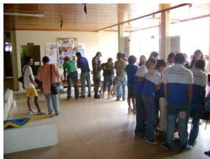
Docs 47 –48: Schools visiting the Museum Kuahí.