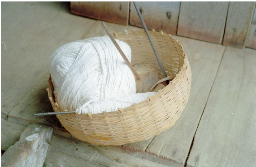
Doc 46: Basket with wad of cotton and spindle for preparing the White hammock.

Another small room was reserved to exhibit only one Galibi Kali’na piece of great value, which was recovered during the project: a white cotton hammock made by two Galibi Kali’na women, one older and another younger, although it is an object that is no longer in use in the village. This single hammock is exhibited in a specific space, accompanied by a basket that has a wad of cotton and the spindle used to prepare the thread.