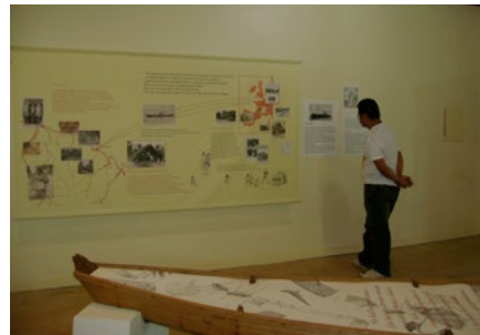
Docs 40 – 41: The indian team of the Museu Kuahí preparing a new exhibit.

interesting material and know another cultural reality.