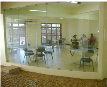
Doc 20: Reading room.

The museum's inauguration, with a significant inaugural exhibit that occupied all of the spaces, would not have been possible without agreement 158/2005 between Secult/AP and the Ministry of Culture – MinC. This agreement allowed Secult/AP to furnish and equip the various installations. The museum now has exhibition rooms, proper storage space, an auditorium that is equipped and suitable for its public, a document processing room, a library, reading room, research room and pedagogy room. At the entrance, a large hall welcomes visitors and also includes a shop that sells crafts. There are also outdoor spaces such as a large veranda, which is used quite often. Thus, the museum has established an exhibit of indigenous crafts available to all the indigenous peoples and residents of Oiapoque, a collection that is quite representative and that is growing through new contributions. The books and magazines from the library have been increasingly requested by indigenous teachers and students to help them in courses. Indigenous teachers from other ethnicities in the region such as the Wayãpi and the Wayana, who are students at the Federal University at Amapá and who are taking courses offered in the city of Oiapoque, also use the library, and leave artifacts for sale in the museum store.