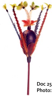
Doc 25.