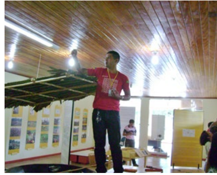
Doc 42 – 43: Preparing the exhibit on manioc fields and cassava flour production.

organizing the data, editing and entering the texts, and for producing designs and photo albums. This research was published in the book, “A Roça e o Kahbe – Produção e comercialização da farinha de mandioca” (Iepé: 2011) “The Planted Ground and the Flour House – Production and Sale of Cassava Flour” and was conceived for use in indigenous schools.