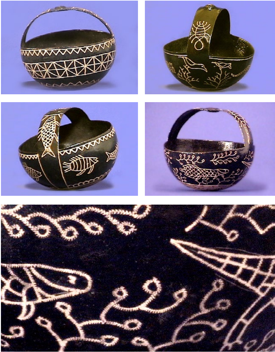
Doc 16 – 19: Engravings applied by a man on gourds previously covered with kumatê paint by his wife.

the design appears in white, standing out more than usual. The innovations introduced do not annul, but reposition the gender differences in the graphic expressions. These two examples show how the Indians, encouraged by these projects, began to take their own initiatives in relation to their cultural goods, conducting systematic surveys and introducing innovations.