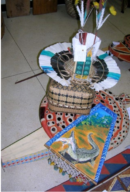
Docs 31 – 34: Collected artifacts for exhibition in Rio de Janeiro, assembled at the Museum Kuahí.