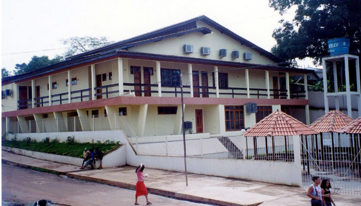
Doc 7 Rear view of the Kuahí Museum.