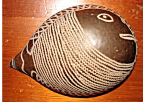
Docs 11, 12, 13, 14: Gourds with figurative and traditional geometric engravings, representing local flora and fauna.