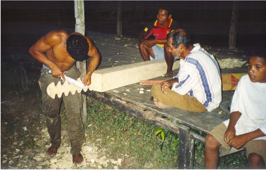
Doc 10: Elderly shaman giving instructions to a young craftsman carving a ritual bench.

with the Indians, sought to encourage the old craftsmen and women, in their own villages and places of traditional production, to transmit to the younger generations their knowledge, information and techniques related to a wide variety of material and immaterial artistic and craft manifestations. The goal was to guarantee the transmission of knowledge that was at risk of extinction, given that only a limited number of people still had this knowledge and most of them were quite old. This project considerably stimulated indigenous craft production in all the villages of the region.