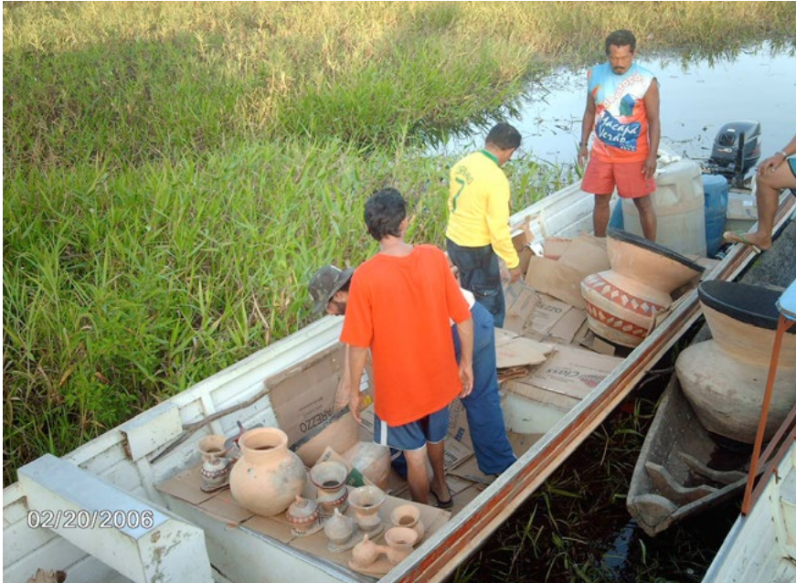
Doc 29: Collecting objects in the villages.