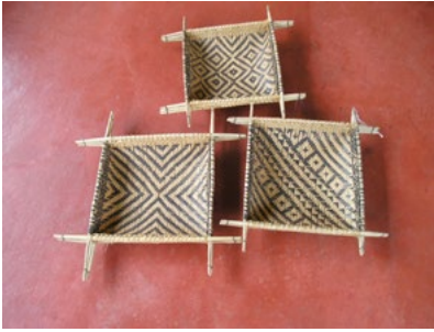
Doc 35. Geometrical symbolic patterns on basketry.