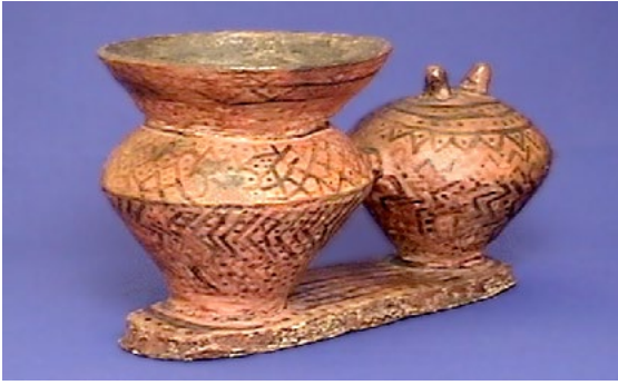
Doc 24.