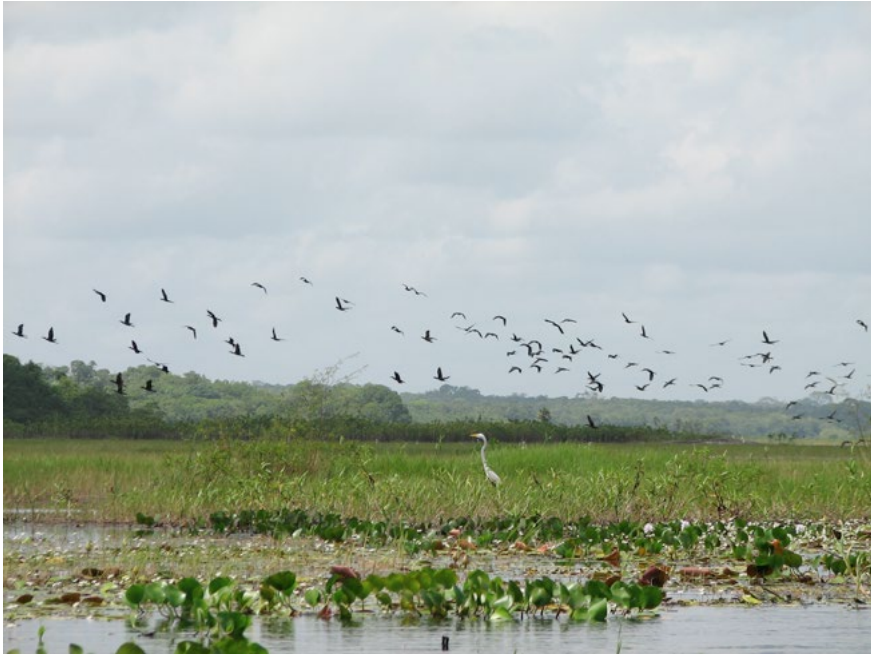
Doc 3. Birds and heron in the flooded savannah.

Over time these people have been able to coexist and construct a space for interlocution, particularly through their annual assemblies, which bring together the four ethnicities and their indigenous organizations. Despite their differences, a visible solidarity prevails among these people because they inhabit a single territory, they experience a common geopolitical situation, and maintain and reactivate relations of kinship and mutual assistance, as well as struggle together for land, healthcare, education, and infrastructure. They share a specific indigenous cosmology, which is Carib, Aruak, Tupi and also Christian, a distinctive factor that the Indians define as “our system.”