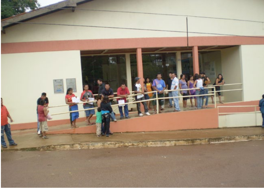
Doc 52: Visitors meeting in front of the Museum.