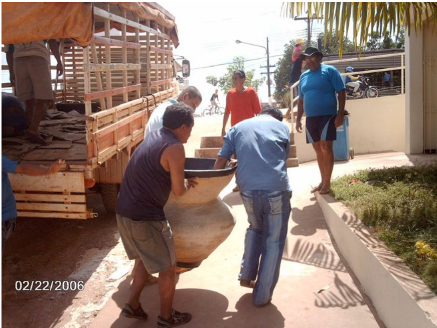
Doc 30: Arrival of the collection at the Kuahí Museum.