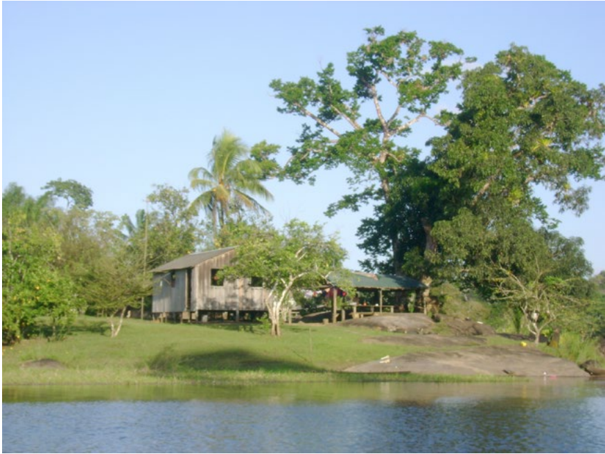
Doc 5. Village on a small island along the Curipi river.

of Oiapoque and even with Saint Georges, in French Guyana, where they sell their agricultural products and artifacts, usually in the street or on the river bank.