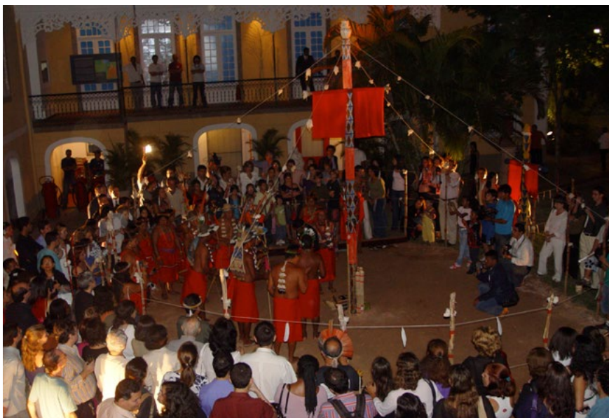
Doc 38: General view of the turé dance.

the basketry and the musical instruments: the cutxi noise horns, the turé clarinets and the maracás . From the domestic environment are sacks of flour, hammocks, football trophies, the banner of the Holy Ghost, and a family altar with their saints, candles and colored ribbons.