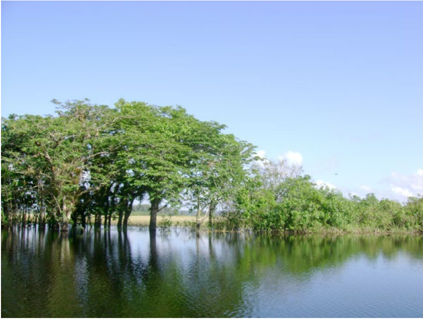
Doc 4.

The landscape typical of the region inhabited by the indigenous peoples of the Oiapoque is a flooded savannah, bathed by three large rivers the Uaçá, the Urucauá and the Curipi, in addition to countless tributaries, igarapés and lakes. The Oiapoque River marks the border between Brazil and French Guyana. The western portion of the indigenous territory has tropical forest with rich vegetation with many palm trees and meets the Tumucumaque Mountains; to the east are the Cassiporé River, Cape Orange and the Atlantic Ocean. The villages and the plantations occupy different islands. It is a region with many birds.