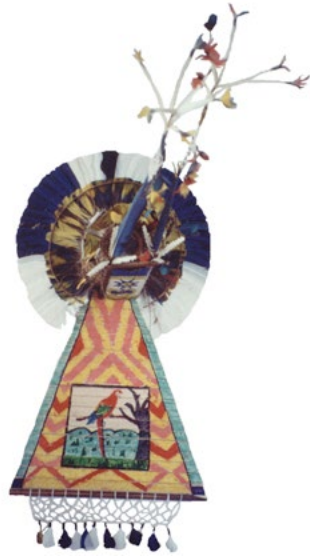
Doc 26 – 27: Feather hat used by men during the turé ritual with geometrical and figurative scenes.