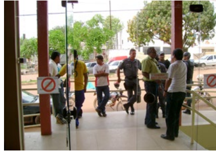
Doc 50. A view of the main street of Oiapoque, from the Museum entrance hall.