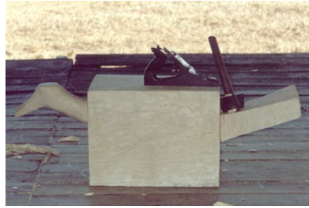
Doc 36. Carving of a shaman's bench representing a bird.

Cultural Revival project APIO/PDPI – MMA. While the elders passed on their knowledge to the younger ones, the artifacts produced were taken to the offices of APIO and stored in a room. They are valuable pieces, many of them experimental and testament to the great effort at the transmission of knowledge among the generations. The collection includes very old pieces that are no longer made, but also innovative pieces, both in terms of form and design. In 2007, this collection was included in the archives of the Kuahí Museum, but as a specific and separate collection, a witness to this work of revival.