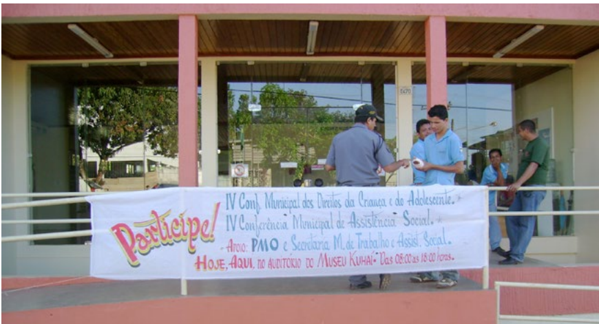
Doc 51. Oiapoque public event held at the Museum.