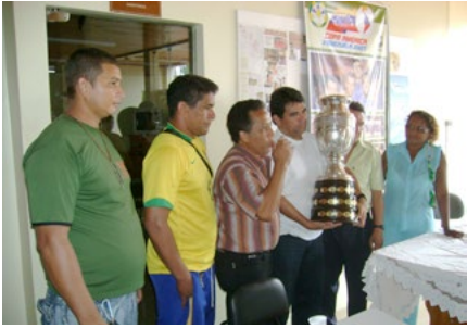
Doc 49 : The America's Cup exhibited in the Kuahí Museum with the presence of local authorities.