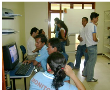
Doc 21: Research room.