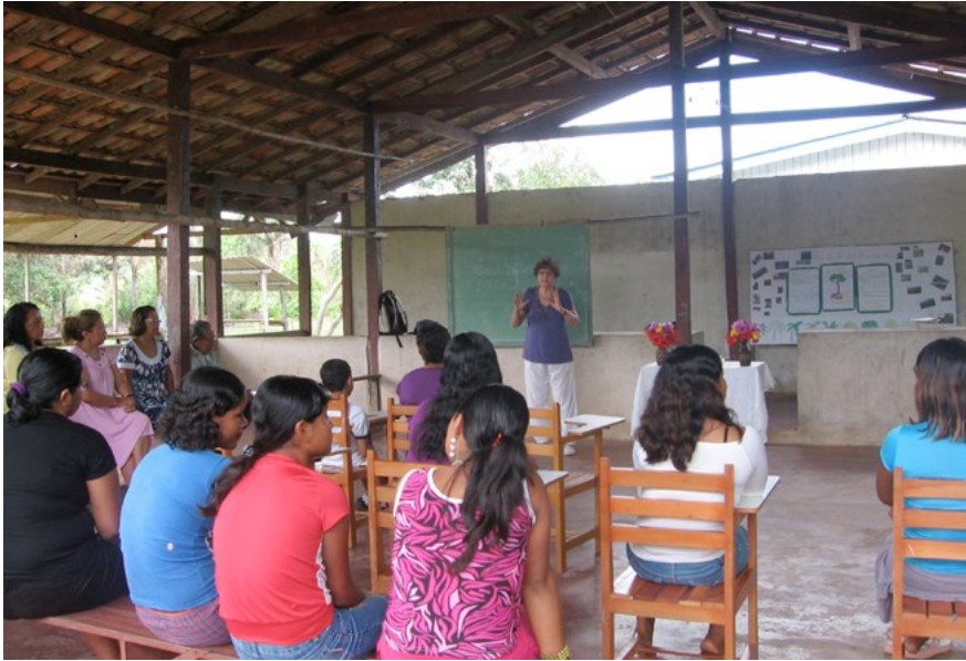
Doc 39: Preparatory workshop of the cross-border exhibit, in the village of São José do Oiapoque.