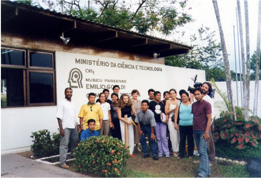
Doc 8: Training workshop at the Museum Goeldi in Belém.