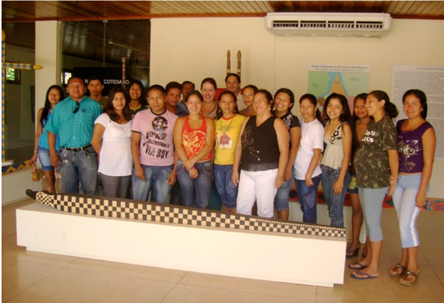
Doc 22: Indigenous staff of the museum and assistants.