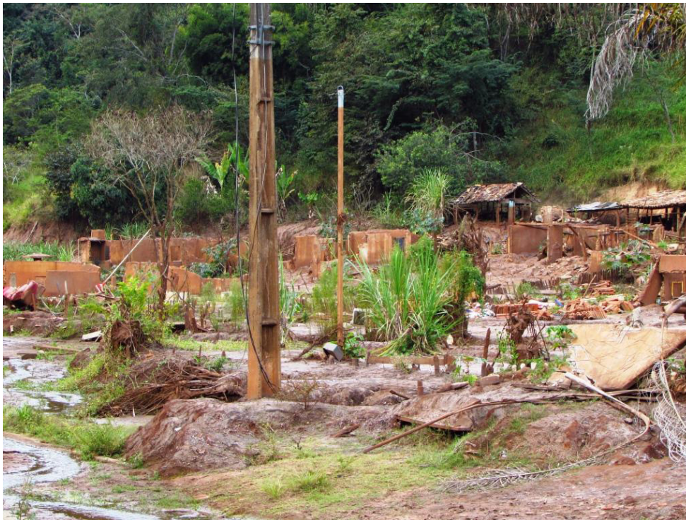
Figure 4 - Debris of Paracatu, 22/07/2016.

It is voting day for the choice of the land where the resettlement will be planned for the community of Paracatu. P. cannot vote. According to the criteria decided, the people who live on surrounding small farms will not be part of the resettlement nucleus, therefore cannot vote. Walking through the same debris, P., who was removed from his house by Civil Defense and relocated on another small farm, asks one of the researchers of our team: “I’m going to ask you because you have more experience with this business of tragedy and resettlement: – if I do not want to come back here, do I have to?, because I don’t want to come back...they were twenty-two years of wonderful living together and today I don’t want to come back here but...they can put me here or put me there, but Paracatu will never be the same. Paracatu doesn’t exist any more” .