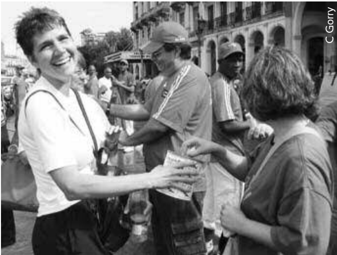
A Canadian volunteer collects money at Havana's Terry Fox Marathon of Hope.

Unlike participants in some other countries, runners in Cuba's Marathon of Hope don't collect donations from sponsors. How, then, does a small, poor country like Cuba raise funds for cancer research, and where does the money go?