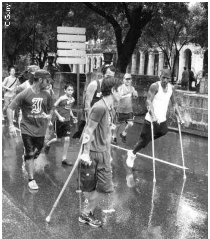
Despite slick streets and grey skies, the spirit of Terry Fox lived on at this year's Run in Havana.