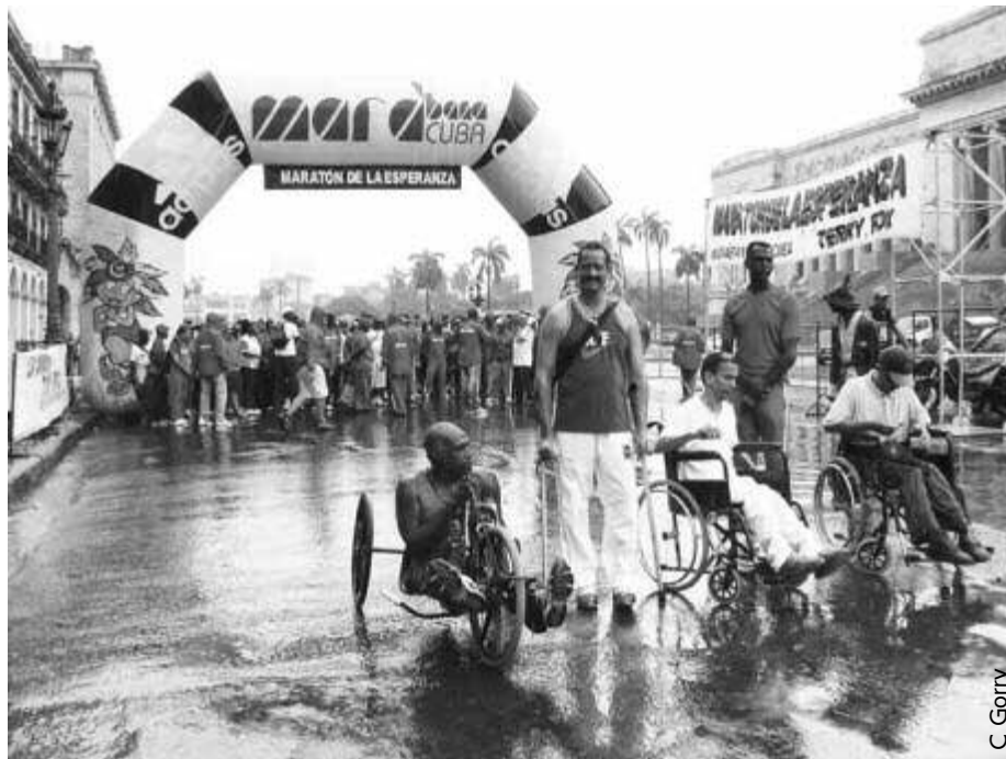
Ready, set, go! The rainy starting line of Cuba's 11th annual Terry Fox Marathon of Hope.

"Even if I don't finish, we need others to continue. It's got to keep going without me,"[1] said Terry Fox as he ran across Canada. Little did the young athlete know that nearly 30 years after uttering these determined words, the world would continue, unflaggingly, to run, walk, cycle, and skate to raise money for cancer research. Ultimately, Terry didn't finish, forced to abandon his "Marathon of Hope" when the cancer that took most of his right leg spread to his lungs. But the heroic amputee had already run a marathon a day—over 3,300 miles—and reached his goal of collecting a dollar for every Canadian to fight cancer. That initial CAD$24 million has ballooned to more than $400 million and keeps on growing thanks to the Terry Fox Run for Cancer Research. First held in 1991, the Run is the world's largest single-day cancer research fundraiser. And the single largest participant country in that event is Cuba.