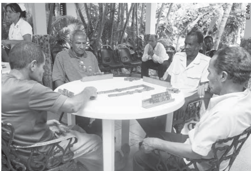
Guanabacoa psychiatric day hospital.