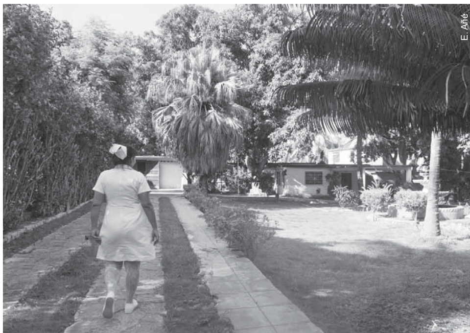
Guanabacoa Community Mental Health Center