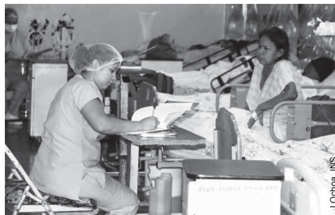
The Nefrolempa study contributed to improved nephrology services at San Juan de Dios National Hospital.

Reliable data on the extent and patterns of the disease are helping this hospital in San Miguel, El Salvador's second-largest city, improve services, cut costs and better serve the public's health. The study also helped equip and design the hospital's new nephrology unit and provided “expert guidance for evalu-