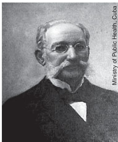
Ministry of Public Health, Cuba