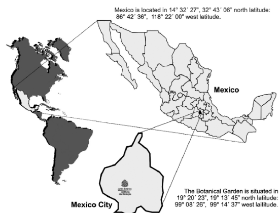
FIGURE 1. Location of Mexico in the world. Illustration J. Saldívar.

This Botanical Garden has the intention to maintain collections of representative living plants of the vegetal diversity of Mexico. These collections, serve as support for research, conservation, education and spreading of the botanical diversity. The Garden has