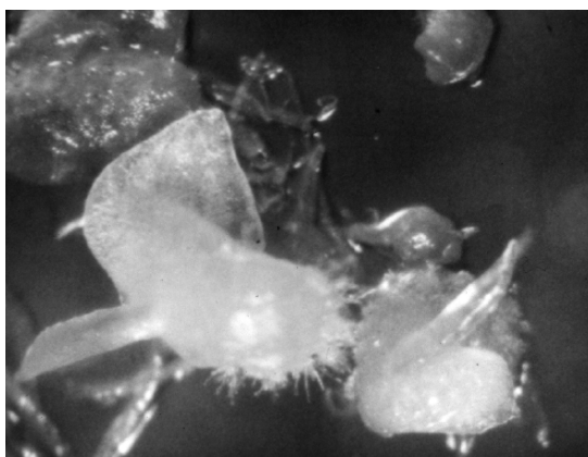
FIGURE 5. In vitro propagation of Euchile citrina . Illustration A. Téllez.