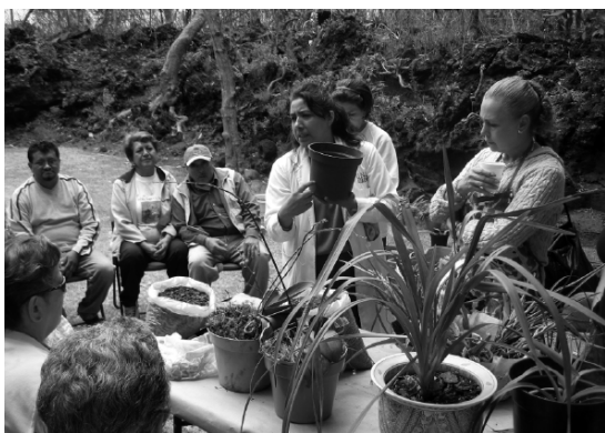
FIGURE 9. Workshop of orchid growing and propagation in Mexico City. Illustration A. Téllez.

urban expansion – all these in addition to the extraction of species of commercial value. For this reason, the Botanical Garden have to rescue plants in zones that have been altered by urbanism, as is the case of