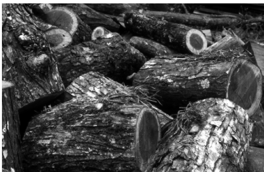
FIGURE 8. Rescue of orchids in Santa Marta, Veracruz, Mexico. Illustration A. Téllez.