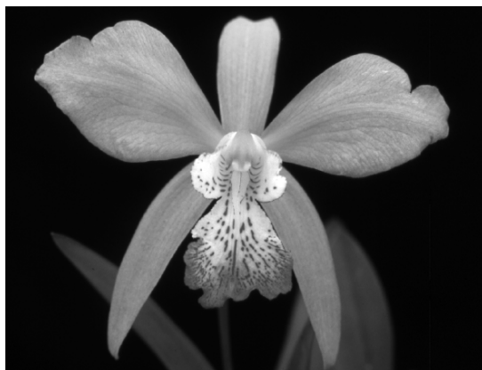
FIGURE 4. Laelia speciosa , endemic species of Mexico and subject to special protection. Illustration A. Téllez.

4. - During recent years the Mexican natural habitat has been transformed by heavy logging, agriculture, cattle raising, chemical pollution, wood fires and