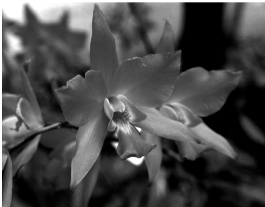
FIGURE 7. Laelia gouldiana , extinct and endemic species of Barranca de Metztilan, Hidalgo, Mexico. Illustration A. Téllez.