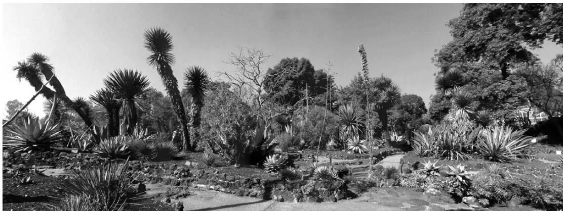
FIGURE 2. A look of the Botanical Garden, UNAM. Illustration J. Saldivar.

plants of arid, tempered and warm-humid zones. From these last two zones, there is a living orchid collection, including epiphytes and terrestrial species (Fig. 3). This collection was started in 1960, and since then, different activities related to the conservation of biodiversity have been carried out, such as: