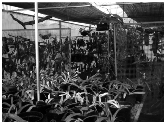
FIGURE 3. Living orchid collection of the Botanical Garden, UNAM. Illustration A. Téllez.

The Botanic Garden shelter and protect under culti-