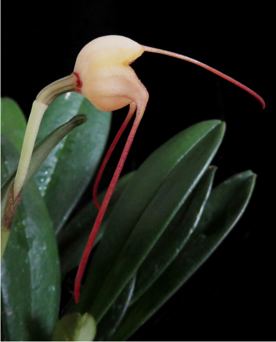
FIGURE 4. Masdevallia tatianae . Lateral view of the flower. Flowered in cultivation and photographed by Perúflora.