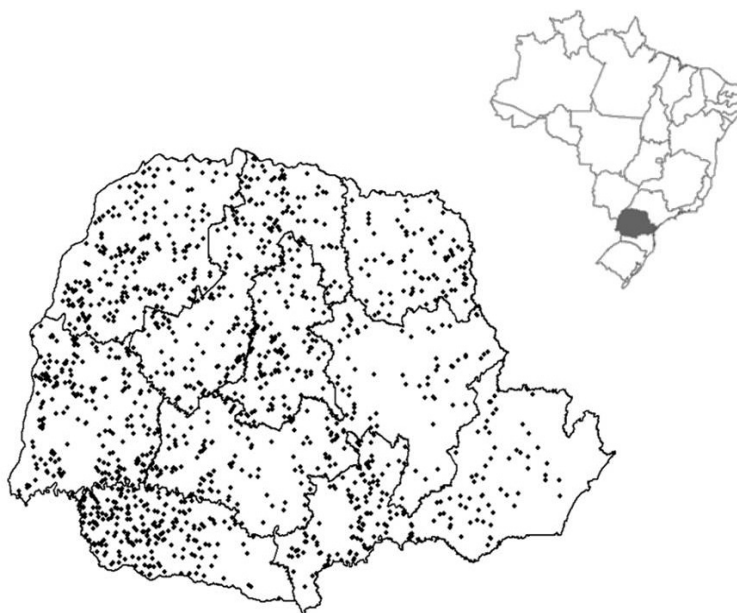
Figure 2. Location of Paraná within Brazil and spatial distribution of sample herds.

Figure 2 shows the distribution of sampled herds throughout Paraná. The responses to the questionnaire completed during the farm visits indicated that Paraná was primarily characterized by small cattle herds dedicated to extensive grazing dairy farming (41.1%) or mixed, dual-purpose, livestock production (42.2%). Only 21.7% of the herds had some degree of confinement, and 16.7% were classified as beef cattle. Only 25% of the farms possessed more than 22 animals of at least 24 months of age. Rented pastures or shared areas between neighboring farms were not very common, reported in only 10% of the sampled farms.