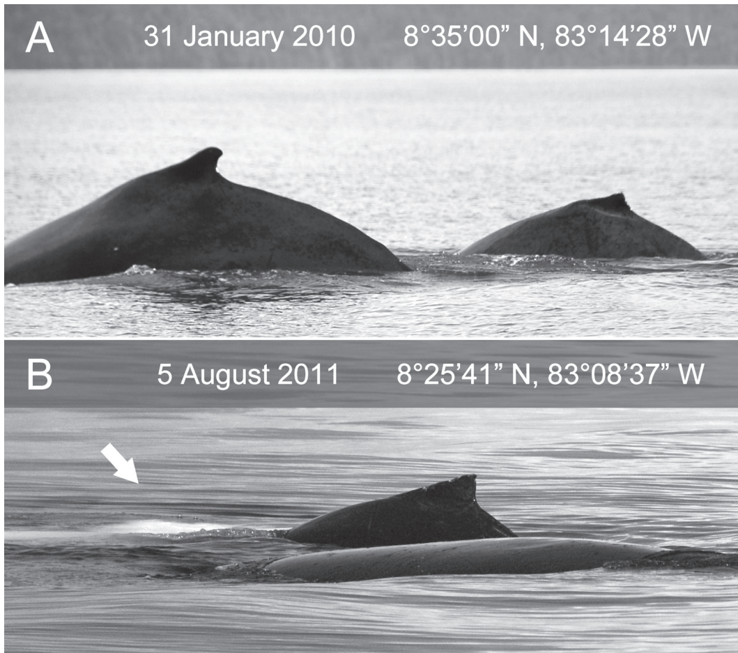
Fig. 3. M. novaeangliae mother-calf pairs inside Golfo Dulce during both dry and rainy seasons. (A) traveling in midwaters between Puerto Jiménez and Golfito, North Pacific migration period; (B) nursing behavior, milk visible in water (arrow), Southern Ocean migration period.

was seen from GA1-4, mostly (N=9) along the coastal perimeter (Bessesen & Saborío, 2012, unpublished), including one specimen in an area of mangroves described by Gaos et al. (2010) as emerging habitat for that species. E. imbricata was notably the smallest sized sea turtle species seen in the inlet. SEA SNAKES. Bright yellow specimens of P. platura of the order Squamata were recorded at 66 sightings, representing 68 sea snakes (Bessesen, 2012, unpublished). The sea snakes were typically (99%) found floating at the surface in GA1-GA2; however, one xanthic specimen was