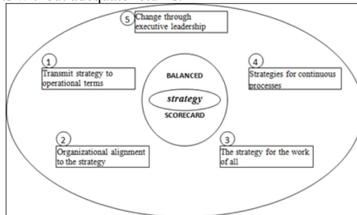
Illustration 2: The principles of organization focused on strategy

For Kaplan and Norton (2001), are the following key strategic themes: (a) Revenue growth and mix: refers to the expansion of products and services, offering options of higher added value and changing its pricing strategy; (b) Reducing the cost / productivity improvement, which refers to efforts to reduce direct costs and products and services and optimize the use of resources; and (c) Asset utilization / investment strategy: attention to the reduction of capital employed for growth, reallocate resources and exempt assets without adequate returns.