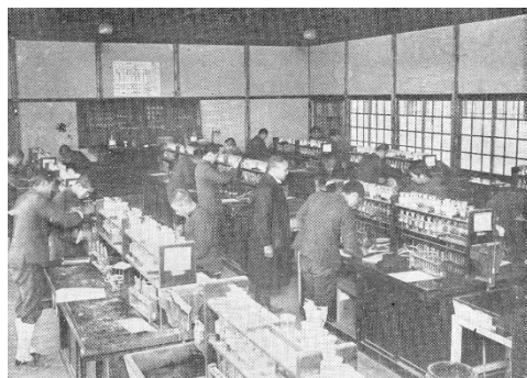
Plate 2: Class in a chemistry laboratory, Hiroshima school (Source: Science Study Group of the Hiroshima Higher Normal School (1932)).