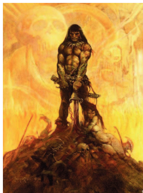
Fig. 3: Frank Frazetta, Conan the Adventurer .

Frank Frazetta, who began his career as an illustrator in the mid-1940s, would have a huge influence on fantasy art, especially on the sword-and-sorcery subgenre, mainly because of his paintings featuring Conan the Barbarian. Most of these paintings offer a wish-fulfillment fantasy in which the viewer can identify with the power and vitality of the hero,