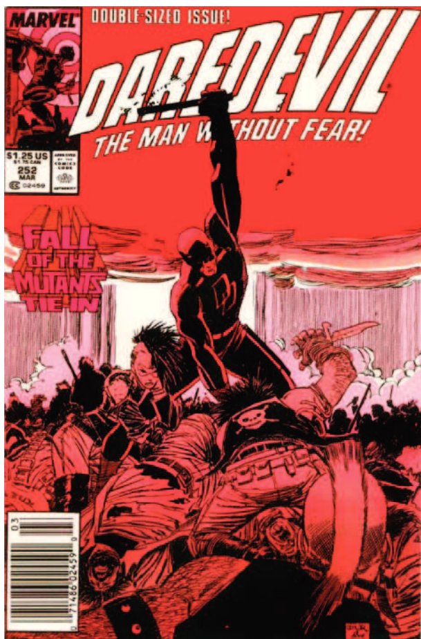
Fig. 1: Daredevil: The Man without Fear! , n. 252 (cover). Art by John Romita Jr. and Al Williamson

Several elements from the cover of Daredevil n. 252—the raised clubs and knives, the shadowy figures suggesting a barbarian horde, the frantic dynamism of the battling figures, and especially the young woman incongruously clinging to the hero’s right leg—reveal its origins in the pulps. In fact, this cover looks like a blend of two paintings by Frank Frazetta inspired by the pulp hero Conan the Barbarian, created by Robert E. Howard: