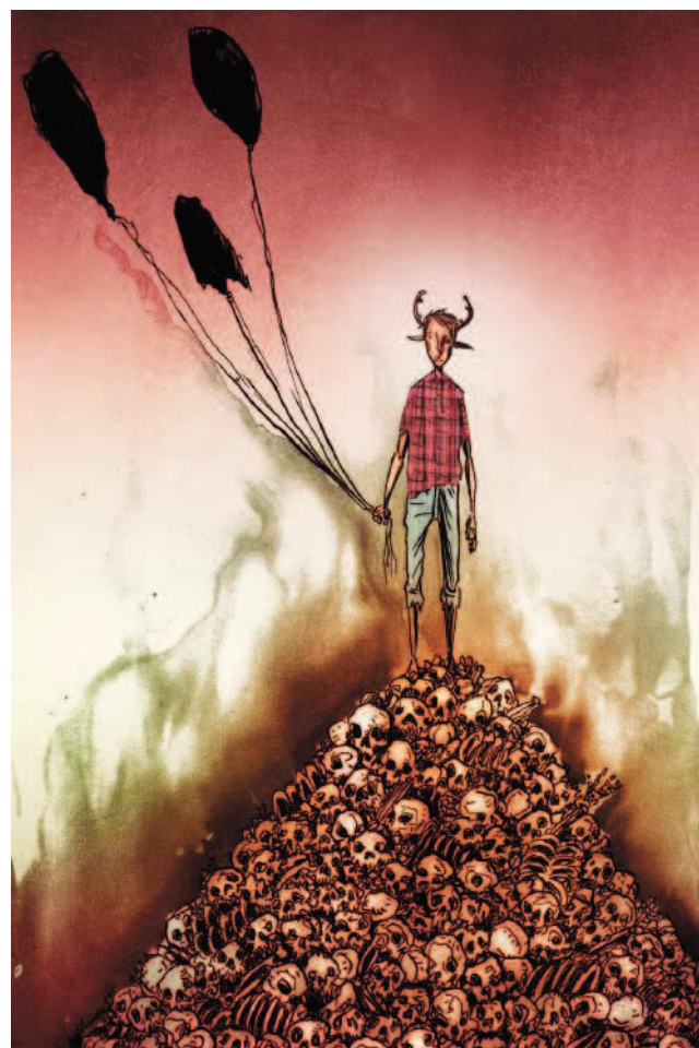
Fig. 8: Sweet Tooth , vol. 4, p. 134. Story and art by Jeff Lemire.

then, becomes itself a hybrid, departing from science fiction and dovetailing into the fantastic. In any case, towards the end it becomes clear that Gus was the first hybrid born and that he probably was the trigger for the disease. This might be enough, then, to place him above his own pile of bodies: