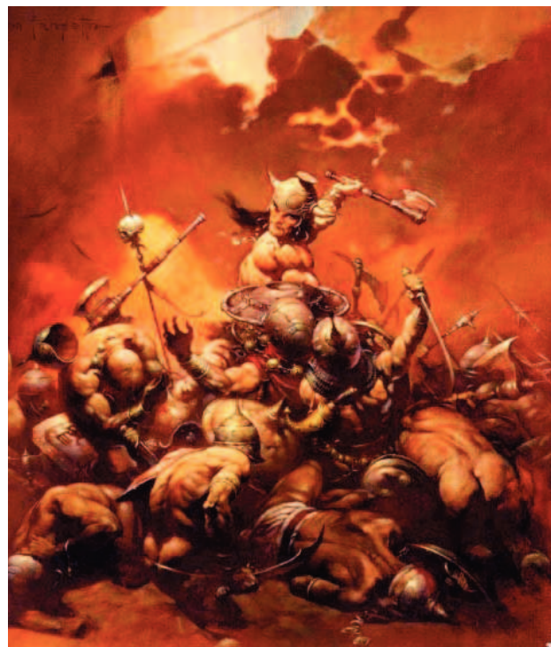
Fig. 2: Frank Frazetta, Conan the Destroyer .

Several elements from the cover of Daredevil n. 252—the raised clubs and knives, the shadowy figures suggesting a barbarian horde, the frantic dynamism of the battling figures, and especially the young woman incongruously clinging to the hero’s right leg—reveal its origins in the pulps. In fact, this cover looks like a blend of two paintings by Frank Frazetta inspired by the pulp hero Conan the Barbarian, created by Robert E. Howard: