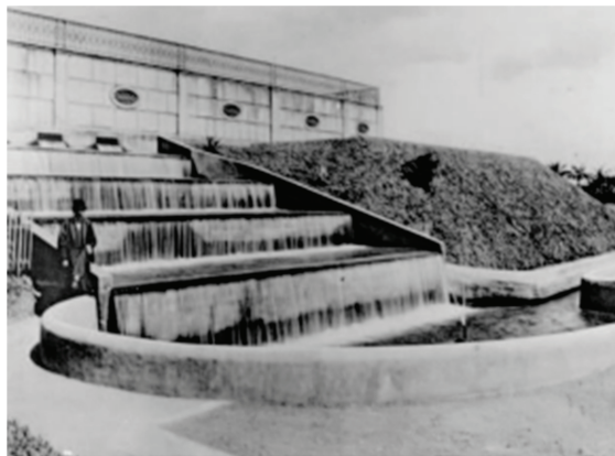
Figure 1. Historic picture of the Pedregulho reservoir

During the nineteenth century the interest in mining works, particularly iron mining, started to gain strength in Brazil. From then on, it started a large demand for geological surveys in such related works, and a close relationship between geology and (geotechnical) civil engineering was established in the country. Then, in 1907, the “Engineering Geology” field of expertise was initiated, whose early works lie in the geological survey for the implementation of railways and roads. Engineering geology also significantly contributed at such a time (as of present) to the development and implementation of the projects of the foundations of embankments and dams, or the special art works (bridges, tunnels) of road/railway constructions.