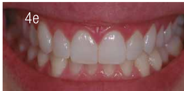
Figure 4. (A) Clinical photographs before treatment. (B) Digital Smile Design. (C) Aesthetics trial performed by the mock-up technique. (D) Contact lenses trial. (E) Final treatment.