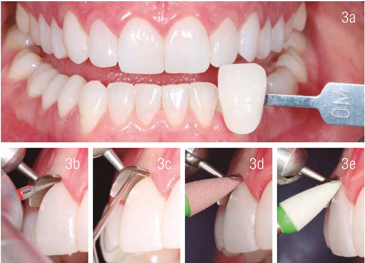
Figure 3. Clinical follow-up of 3 years. (A) Vita Colour guide shows colour follow up in comparison with inferior incisors. A minor gingival inflammation is perceived in cervical area of the right superior central incisive. (B) Fine-grained diamond tips are used for finishing and polishing with the aid of a Gingival Protector Zekrya # 260 (Dentsply Maillefer, Switzerland). (C) evaluation of marginal seal after polishing procedure. Special polishing rubbers for lithium disilicate (LS Gloss # 1435, Jota, Switzerland) are applied to pre-polish area (D) and (E) high-gloss polishing.