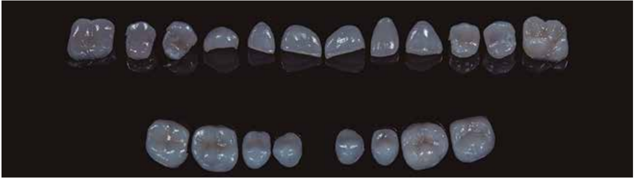
Figure 2. Contact Lenses before adhesive cementation. Observe the difference in thickness that influence in the polishing procedure of superior marginal seal.