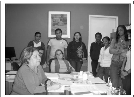
Image 1 - Presentation on the University and the EEAP, at the EEAP’s Principal Room

We have highlighted some images that represent the three meetings for having a general idea.