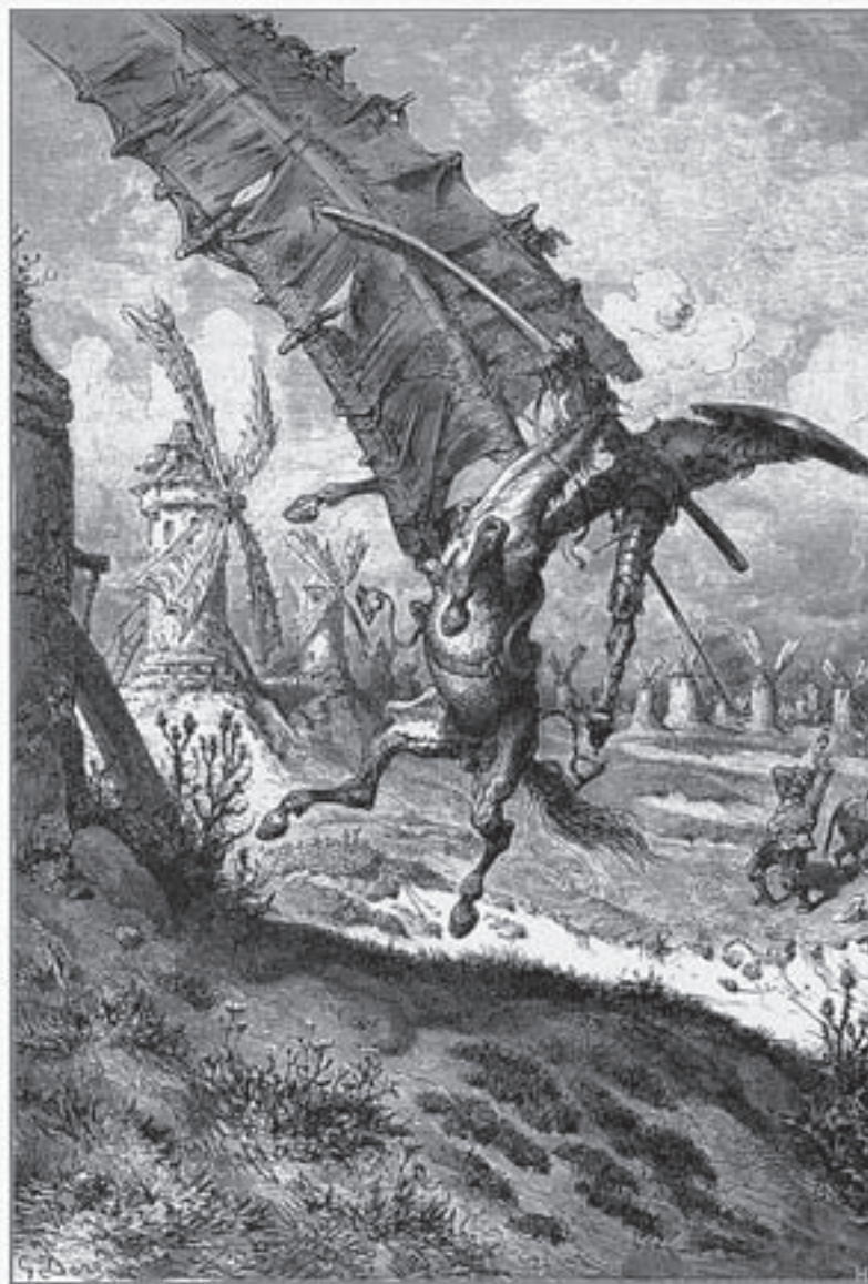
While the modern adjective quixotic ranges in meaning from idealistic and whimsical to foolhardy, capricious or delusional, John Cleveland's early usage suggests the latter end of this scale: «The Quixotes of this Age fight with the Wind-mills of their owne Heads». The image shows an illustration by Gustave Doré from the 1863 edition of Don Quixote .