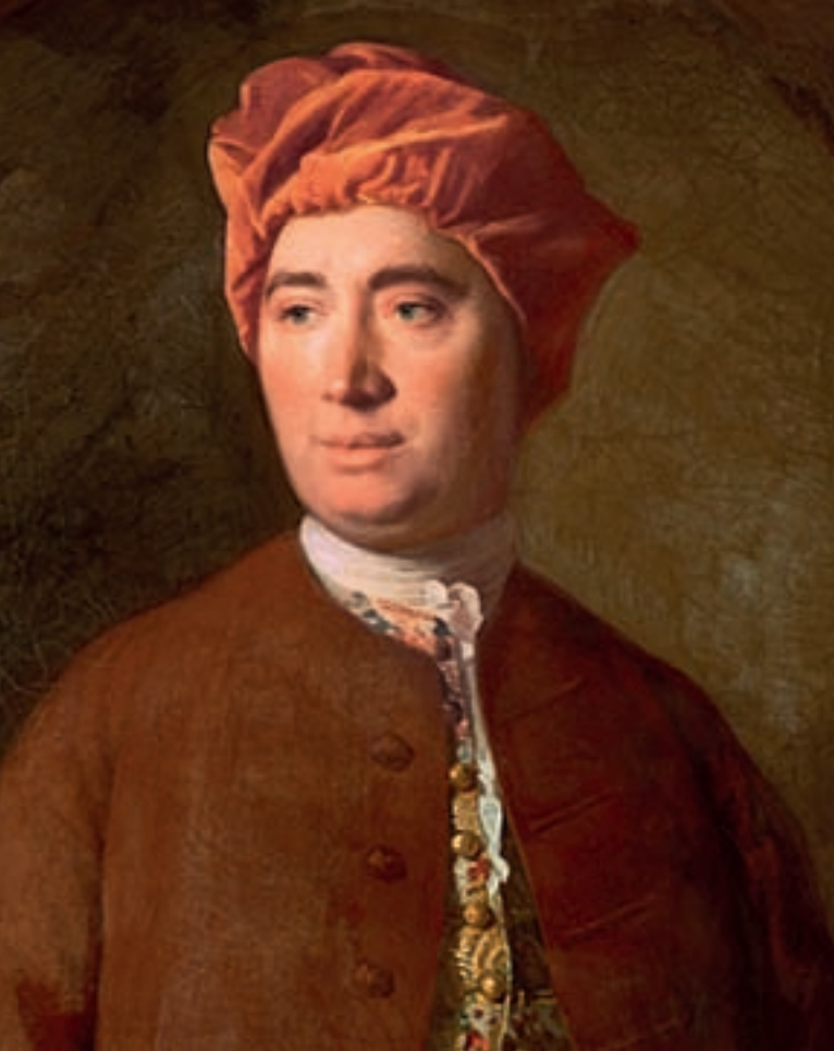
In his book An Enquiry Concerning Human Understanding , published in 1748, the philosopher David Hume argued against believing in miracles because they denied natural laws. In the picture, portrait of David Hume by Allan Ramsay.

There is another class of statements made by religious people, which are favored by theologians and philosophers, and that concern the creator of the universe, or the reason why there is something rather than nothing, or the god of the anthropic principle, or the one of intelligent design, etc. This is what one might call the «metaphysical god». It is always a «god of the gaps», in the sense that it is supposed to provide answers or explanations that science does not provide. Of course, that god does not perform miracles or answer our prayers (at least, none of the arguments advanced in favor of its existence suggest that he does). In that sense, its existence cannot be empirically refuted. But what is more important is that it cannot be characterized in any specific way. Just because there is supposed to be some Being «explaining» what we do not know does not mean that this Being likes us, cares about us, is good or bad or almighty. In short, it has nothing to do with the various gods that actual existing religious people worship and from whom they expect some reward, usually in this life or at least in the afterlife. It is only an abuse of language that allows theologians to speak of the metaphysical god as if it coincided with the one of the gods in which their credulous followers believe.