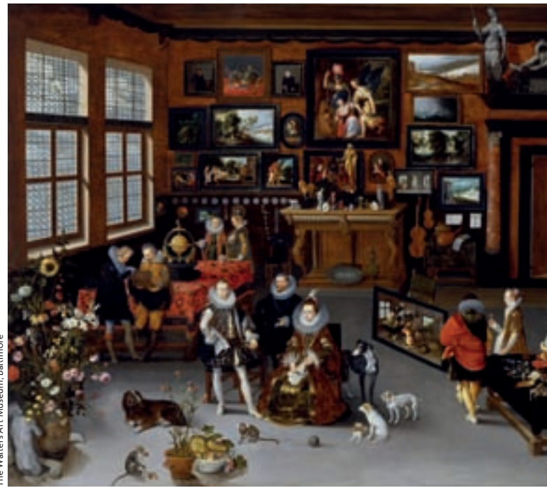
The Walters Art Museum, Baltimore

When it turns out that the object of knowledge is too complex or invisible to be objectively observed, is scarcely intelligible, or when such poor intelligibility turns out to be shielded against reality, the scientific method enters a crisis and the recommendation to abandon it becomes sensible. In these cases we can try another method based on a single fundamental principle that we can call principle of communicability of unintelligible complexities. According to it, a human mind can transmit an ostensibly infinite complexity to another with a gesture (a work, a piece of reality) that is necessarily finite. From the point of view of the scientific method the possibility seems almost a miraculous. Nonetheless, many declarations of Homo sapiens over millennia support it. The only thing this