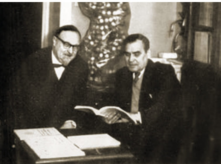
From Oparin. Dedicated to the 120th anniversary of the birth (2014). Moscow: Geos.