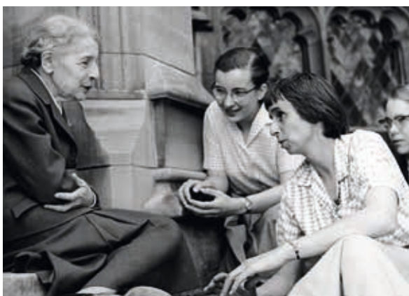
Lise Meitner is among the female scientists whose legacy has been rescued from oblivion by gendered scientific studies. In the picture, the Austrian physicist and a group of her students at the stairs of Bryn Mawrs College, Pennsylvania (1959).

This fruitful research programme did not come out of nowhere; its genealogy can be traced back almost four decades, to a time when female philosophers and science historians documented gender biases in traditional science and gave life to a new research field: gender and science studies.