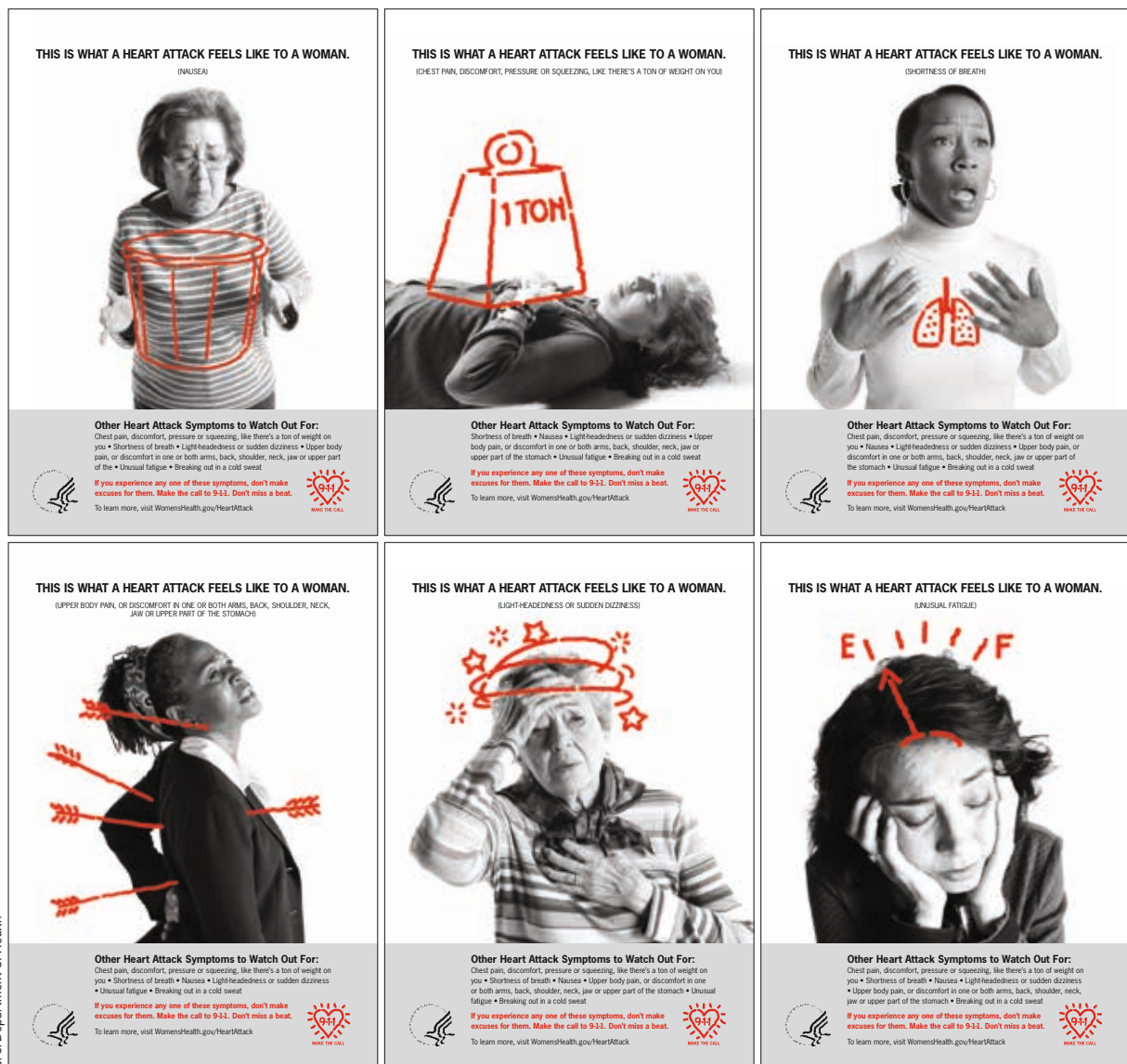
Posters for the campaign Make the call , created by the United States Office on Women's Health in 2011. A series of images provide information about heart attack symptoms in women, which were largely unknown by those who might be affected.

«GENDER STEREOTYPES PREVENTED THE ADEQUATE CONCEPTUALISATION AND INVESTIGATION OF SEVERAL PROBLEMS, AS IN THE CASE OF CARDIOVASCULAR DISEASES»