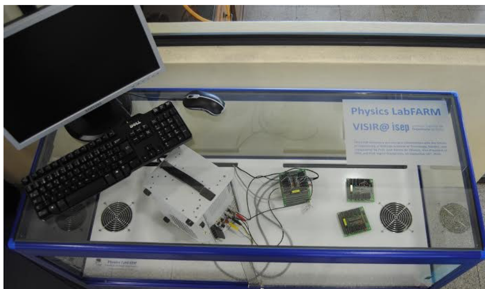
Figure 1. VISIR System at ISEP (Polytechnic of Porto, Portugal).

The European Countries VISIR users have, along the time, set cooperative and institutional ties and thought of creating a consortium/project to replicate in South America (Brazil and Argentina) the level of cooperation and novelty associated with VISIR in Europe. This led to the VISIR+ Project, started in November 2015, being Polytechnic of Porto, School of Engineering/CIETI-LABORIS the project coordinator. Through this project, a VISIR system is being installed in each Latin American (LA) partner (in five HEI) and it will be used not only by the owner institution (the one, in which, VISIR is installed) but also for other secondary/professional/higher education institutions, under the initial guidance of an European partner. The fact each LA HEI possess a VISIR system is expected to contribute to an increased sense of ownership, both by students and teachers, promoting its adoption.