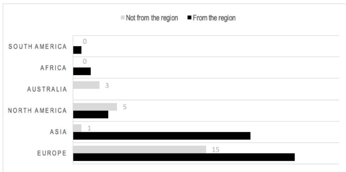
Figure 3. Number of MALLL graduates according to current region of residence (N=75)

As shown in Figure 3 above, Europe currently holds the largest share of MALLL graduates' place of residence, 62.50% of which are European graduates themselves. Out of this percentage of European graduates currently residing in Europe, more than three-fifths (N=11) hails from EU countries. Second to Europe, Asia holds a significant share