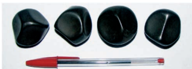
Figure 1 Balls collected from ball charge sampling.

many balls with different shapes as shown in the Figure 1.