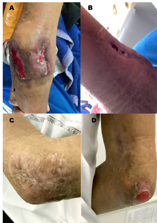
Figure 1. A) Right elbow posterior view with presence of two plates with irregular borders, hyper-chromic, with ulcerative center of flat erythematous bottom. B) Posteromedial region with presence of two fistulas. C) Posterolateral view with presence of residual hyperchromic macula. D) In the posterior region, there is reduction of ulceration and closure of fistulas.

Computed tomography showed the elbow joint