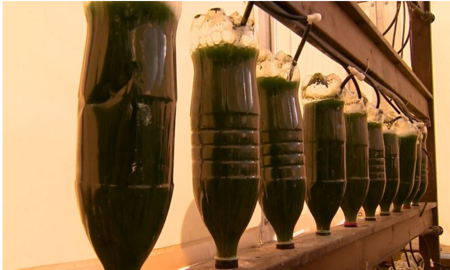
Figure 1. The Spirulina cultivation array Herzeliya Gymnasium.

The students grew the Spirulina in repurposed plastic bottles (Fig. 1) and open pool-like containers. Senior students (11th or 12th grades) were responsible for teaching the cultivation method to newcomers (9th or 10th grades). Some students also got to travel to different schools in Israel, as well as to remote places abroad, such as South Africa and Rwanda, to teach their method to others. Thus, the students not only developed the growing method for Spirulina , they were also responsible for communicating their findings to others, locally, nationally and globally.