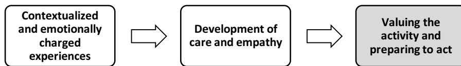
Figure 5. Contextual experiences as catalysts to students taking action.