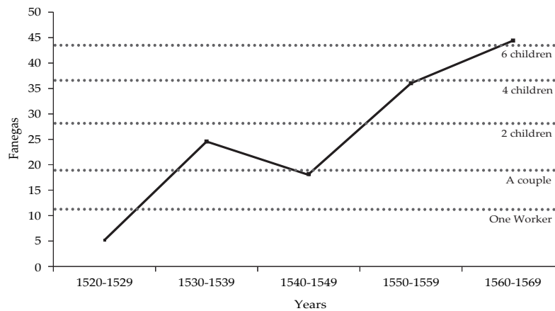
FIGURE 3 Wage in fanegas of maize (1524-1569) and subsistence wage