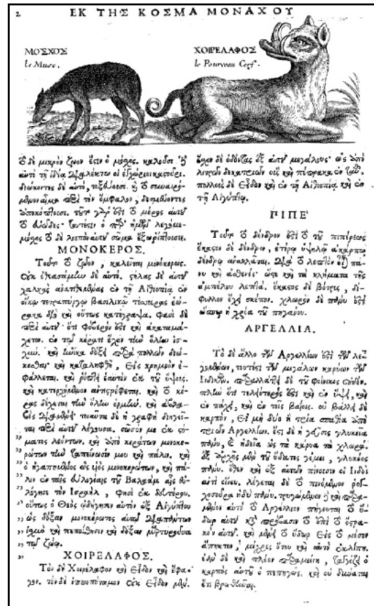
Fig. 1: Depiction of a χοιρέλάφος in Melchisédech Thévenot's Relation de divers voyages curieux (1663), 1: 2 44 .

tion between the parts of the body. Furthermore, the image is strictly associated with the caption, which has no realistic support within the image. In other terms, images in Thévenot's work show animals as if they were taxidermic specimens, exposed in a labeled glass box (Fig. 1).