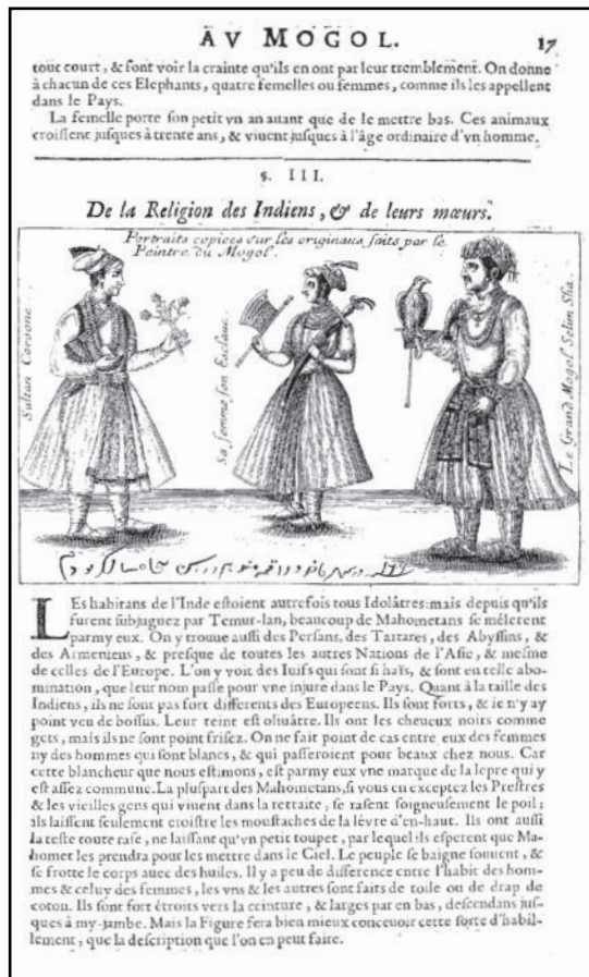
Fig. 2: Depiction of Indian costumes in Melchisédech Thévenot's Relation de divers voyages curieux (1663), 1: 17.

out their veracity. In the Voyage de Terri au Mogol 52 , for instance, one of the engravings shows this interesting label: “Portraits copied on the originals, executed by the Painter of the Mogul 53 ” (Fig. 2).