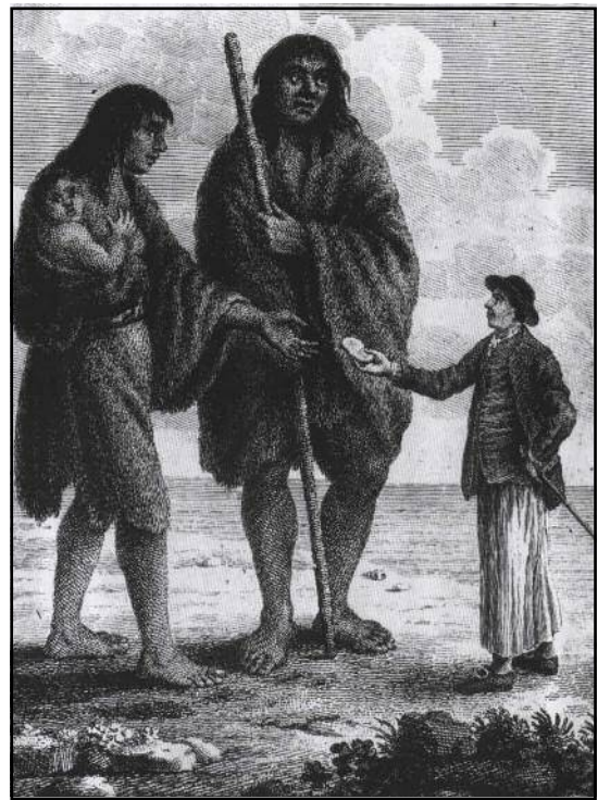
Fig. 3: “A Sailor giving a Patagonian Woman some Biscuit for her Child”, from A Voyage Round the World in His Majesty’s Ship the Dolphin (Anonymous 1767: frontispice)

Let us compare, now, this verbal account with the image of a family of ‘Patagonian giants’, from the anonymous work A Voyage Round the World in His Majesty’s Ship the Dolphin (Anonymous 1767: frontispice) (Fig. 3):