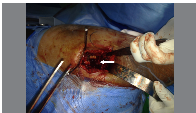
Figure 2. The TAL was carefully identified.