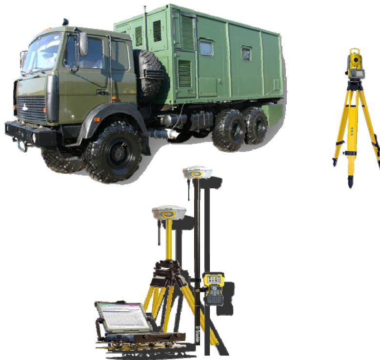
Figure 4 – Mobile navigation and geodetic complex Рис. 4 – Подвижный навигационно-геодезический комплекс Слика 4 – Мобилна навигација и геодезски комплет

During this period, the Department of Geoinformation Support of the Main Directorate of Armed Forces of the Republic of Kazakhstan purchased a mobile navigation and geodetic complex for the topographic part intended for the operational solution of tasks related to topographic and geodetic training of areas for combat use of troops, topographic and geodetic reference (control of the accuracy of topographic and geodetic reference) of the elements of military combat units, and topographic reconnaissance, Figure 4.