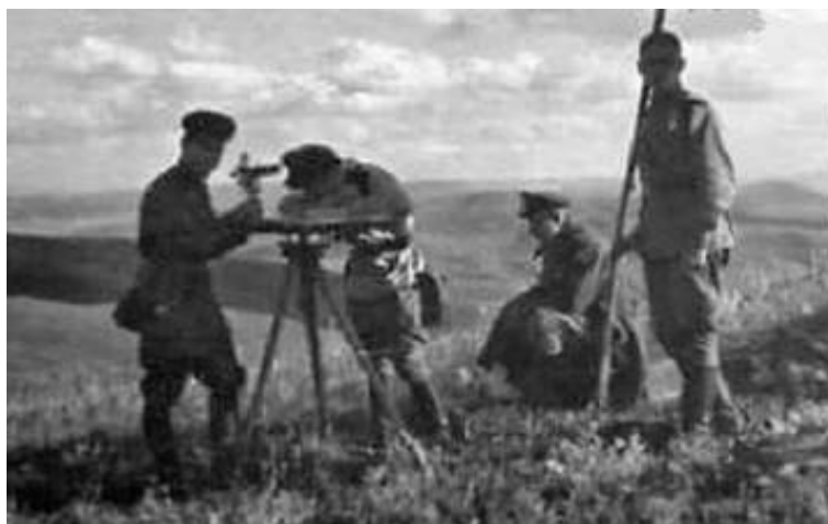
Figure 1 – Mapping the territory of Kazakhstan Рис. 1 – Картографирование территории Казахстана Слика 1 – Мапирање територије Казахстана

The history of mapping of Kazakhstan is inextricably linked with the mapping of the territory of the USSR. Until 1945, all topographic and geodetic and cartographic work was carried out by the topographic and geodetic teams of the Central Asian Airborne Geodetic Enterprise and by the topographic teams of the West Siberian Airborne Geodetic Enterprise Figure 1.