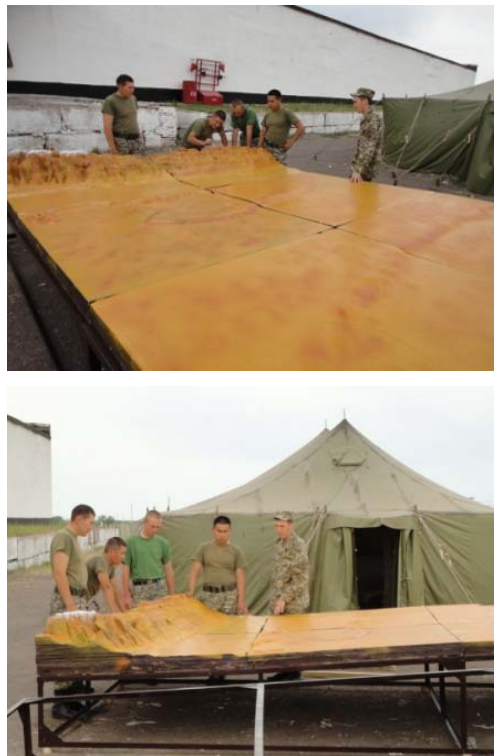
Figure 2 – Production of the terrain models by topographers of the Armed Forces of the Republic of Kazakhstan in 2010

During this period, the Military Topographic Directorate of the General Staff of the Armed Forces of the Republic of Kazakhstan acquired modern topographic and geodetic instruments for performing topographic and geodetic work, Figure 2.