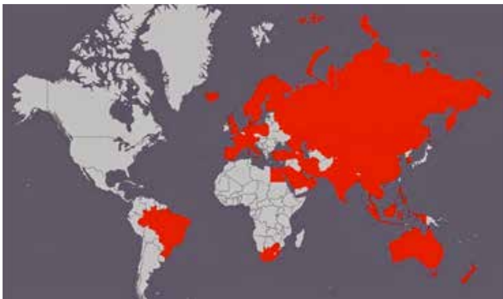
Figure 3. The Range of Member States Covered in the Asian Investment Bank Led by China