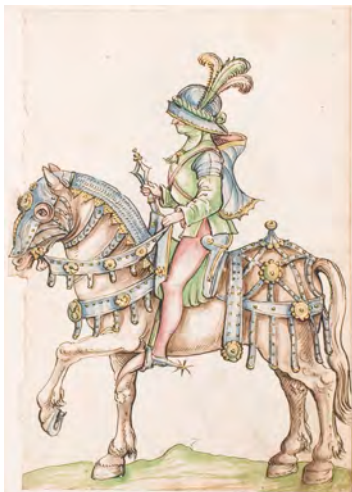
Fig. 4 (left): Thun Artist A, Rider armoured in the style of circa 1480 riding a horse lightly armoured in the style of circa 1510, circa 1530-1540, Thun-Hohenstein Album, Prague, Uměleckoprůmyslové museum v Praze, GK 11.572-B, folio 8r.