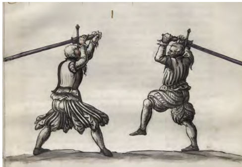
Fig. 14 (left): The First Strike , Jörg Wilhalm, Fechtbuch , circa 1522, Universitätsbibliothek Augsburg, Cod. I.6.2.3, fol. 2r.