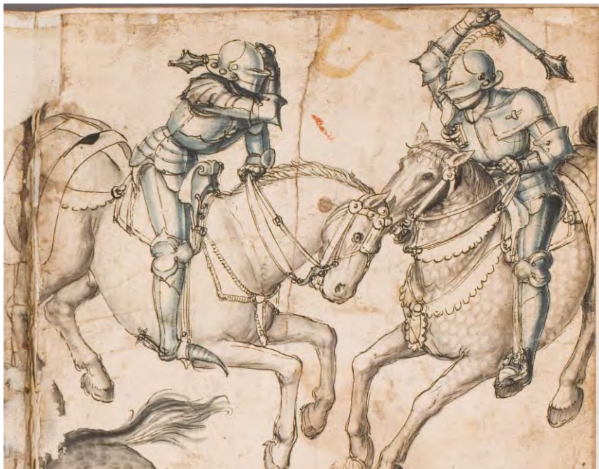
Fig. 6: Unknown Artist, Study of Three Pairs of Combatants (detail), circa 1470s-1480s, ink and wash, Thun-Hohenstein Album, Prague, Uměleckoprůmyslové museum v Praze, GK 11.572-B, folio 11r.

became intimately associated with knightly identity. Once again, Artist A's courtly figure, armed in the style of 1480 and carrying a flanged mace in procession or triumphal entry, demonstrates this practice (see fig. 4).