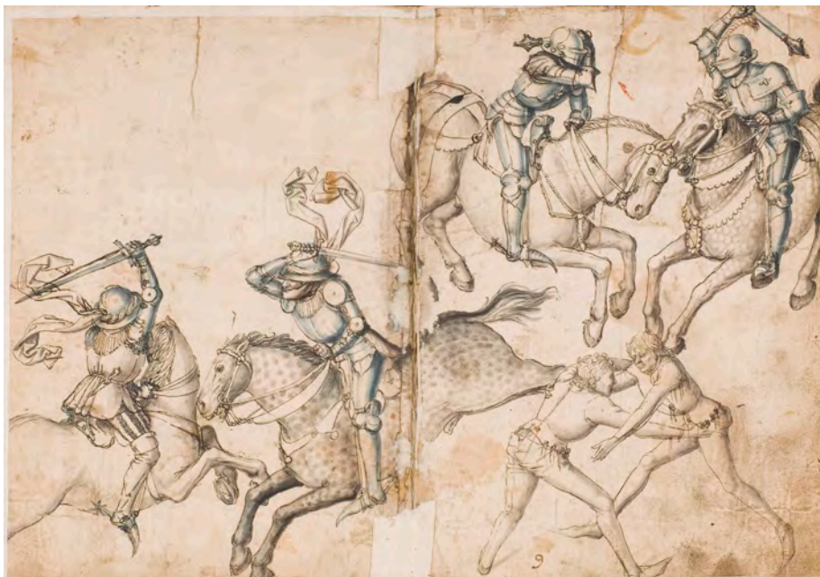
Fig. 1: Unknown Artist, Study of Three Pairs of Combatants, circa 1470s-1480s, ink and wash, Thun-Hohenstein Album, Prague, Uměleckoprůmyslové museum v Praze, GK 11.572-B, folio 10v-11r.

The vanquished man's sword lies beneath his body, and he looks upward toward the victor's weapon, poised to deliver a final strike through the unfortunate man's open visor.