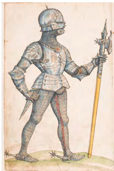
Fig. 21: Artist A, Thun-Hohenstein album , folio 12v, figure armoured in the style of 1495 for the tournament on foot, 1540s.

Between the opening of folios 10v and 11r, with its six pairs of fight-book-inspired fighters, and the meticulous depiction of armoured combatants on folio 12r, a third fifteenth-century image (fig. 22) depicts three standing soldiers clad in stylized versions of elegant late gothic field armour. This drawing has been glued to folio 11r, formed by the verso of the preceding opening. Brown gall ink articulates the soldiers' gracefully swaying figures and strikingly expressive faces. Grisaille washes evoke the volumes of