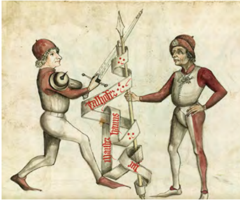
Fig. 11 (left): Hans Talhofer, wearing the badge of the Marxbrüder, and a student, 1459, Copenhagen, Det Kongelige Bibliotek, MS Thott.290.20, fol. 101r.