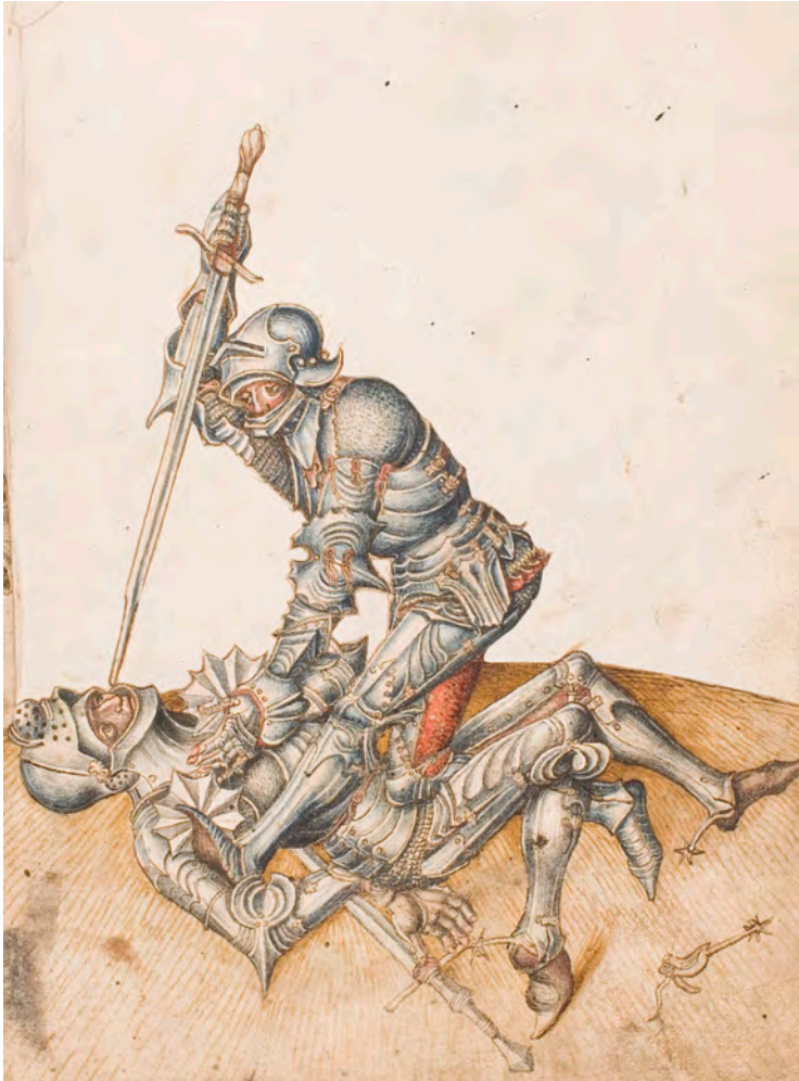
Fig. 2: Unknown Artist, Subduing an Opponent , after circa 1495, ink and wash, Thun-Hohenstein Album, Prague, Uměleckoprůmyslové museum v Praze, GK 11.572-B, folio 12r.

they predate the images that surround them by up to five decades and represent fifteenth-century pictorial and literary genres that established visual languages of the armoured body that resonate through the album's later drawings.