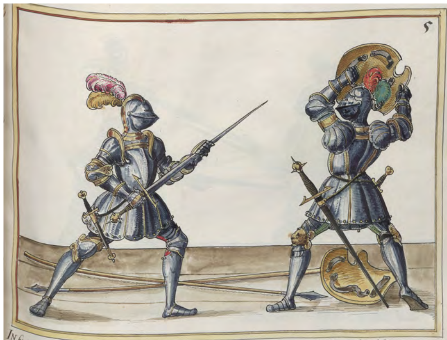
Fig. 18: Workshop of Jörg Breu the Younger, De Arte Athletica vol. II, circa 1542, Vienna, Österreichisches Nationalbibliothek, Cod. 10826 Han, fol. 208r.

anonymous book painters of the Breu workshop, each of whom also made vivid use of metallic washes to sculpt the armours, weapons, and costumes that he depicted. Images by artists who illustrated the sections on armoured combat on foot that populate the last sections of the second volume bear particularly tantalizing similarities to the sixteenth-century drawings that fill the Thun album (fig. 18). These works, like the sixteenth-century drawings by the anonymous Artist A that the album collects, build the forms of armoured bodies from confidently loose lines that are drawn in black ink, which provide armatures for layers of translucent gouache, highlighted with veils of metallic wash.