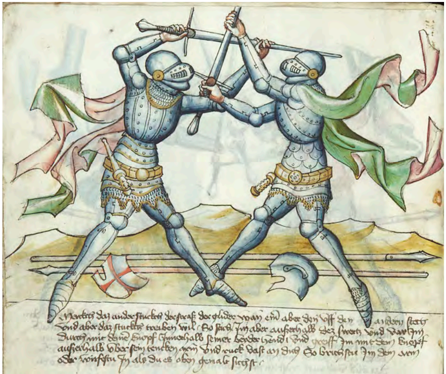
Fig. 10: The “Way of the Joins,” Gladiatoria , circa 1430, Vienna, Kunsthistorisches Museum, KK 5013, fol. 11v.

That last phrase, “as you see it painted above,” is a refrain, repeated on nearly every page throughout the Gladiatoria codices. Importantly, these manuscripts not only demonstrate textual expansion of the zettel , but also the increasing emphasis on images of combatants, which were once illustrative accompaniments to the Fechtmeisters’ verses, as important sites of knowledge that participated in dialogue with the text and expanded upon the meanings that it conveyed to the reader/viewer. 61