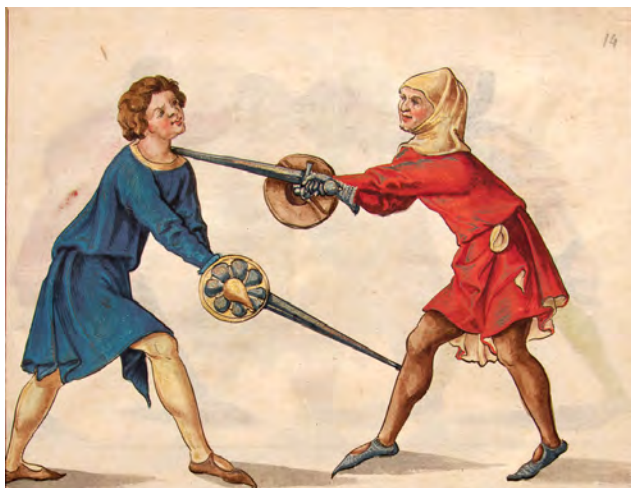
Fig. 16: Jörg Breu the Younger, Sword and Buckler , Paulus Hector Mair, Sammelband (Ring- und Fechtbuch), Universitätsbibliothek Augsburg, Cod. I.6.2.4, fol. 14r.

Fechtbuch , not only includes Breu's characteristic images of fencers and grapplers clad in elaborately puffed and slashed sixteenth-century fashions. It also contains mid-sixteenth century illustrations that adopt the style of the fourteenth century; in doing so, these images acknowledge the perceived authority of late medieval martial traditions. Folios 14 and 15 depict combat with sword and buckler (fig. 16). Although illustrated by Jörg Breu the Younger during the 1540s, their content and style evoke far older works, such as the so-called Walpurgis Manuscript, Royal Armouries I.33. 74 The costume and facial physiognomies of Breu's figures echo those in this rare early fencing treatise, and suggest that Breu may have had access to a manual of similar date from Mair's or another Augsburg collection.