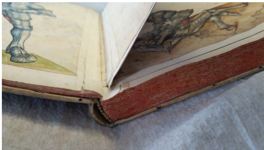
Fig. 19: View of the interlude of pages between the album's first and second quires, all glued onto the same short tip that forms folio 12, Thun-Hohenstein Album, Prague, Uměleckoprůmyslové museum v Praze, GK 11.572-B, folio 10-12.

The three folios that support the fifteenth-century drawings cling to a single, short tip of early-seventeenth-century paper that is contiguous with the tips used to anchor the drawings in the album's second quire (fig. 19). Thus, folio 12, whose recto forms the surface to which the fragmentary drawing of fifteenth-century swordsmen is pasted, constitutes both the last of the inserted drawings and the first leaf of quire two.