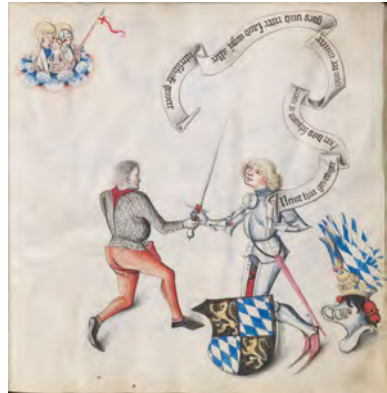
Fig. 12: Dedicatory Miniature, Paulus Kal's Fechtbuch for Ludwig of Bavaria, Bayerische Staatsbibliothek, Cgm. 1507, fol. 5r.

As fight books relied increasingly on pictorial communication, the indoctrinated viewer would have been called upon to “textualize” the minimally captioned or completely unannotated images. Like the laconic verses so often deployed in the genre, the illustrations of martial manuals functioned as mnemonic prompts that could induce viewers to recall not only the verbal rhymes associated with them, but entire repertoires of movement and strategy. Thus, the glimpses of armoured and unarmoured combat that appear in the Thun album’s fifteenth-century drawings could have stimulated viewers’ recollection of the actions that constituted particular fighting traditions, the verses that helped commit them to memory, and the absent masters who taught them.