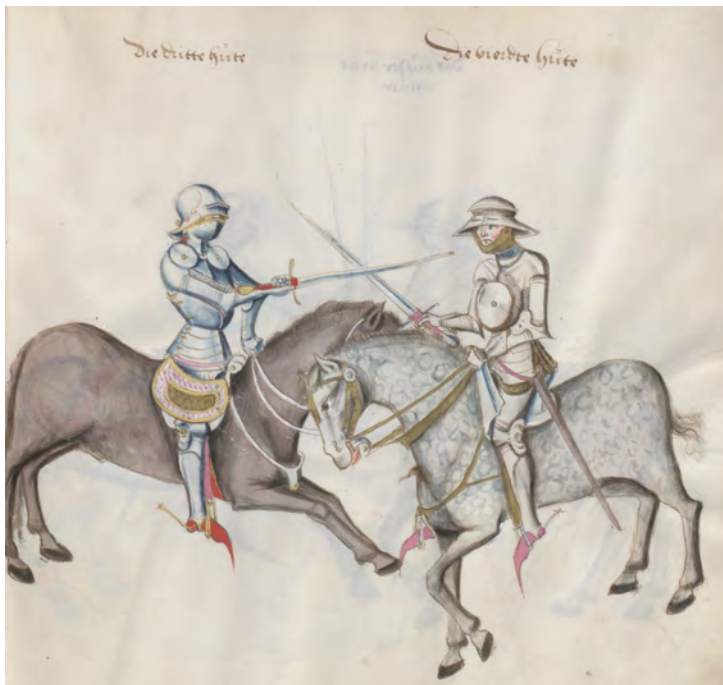
Fig. 13: The Third and Fourth Strikes , Paulus Kal's Fechtbuch for Ludwig of Bavaria, Bayerische Staatsbibliothek, Cgm. 1507, fol. 13r

to introduce the basics of swordplay. In contrast to the page's minimal text, the two figures and their steeds are fully visualized, and do indeed bear striking parallels to the mounted pairs who spar in the opening of the Thun album. The figure on the left sweeps his sword toward his opponent in the underhanded “Third Stroke”, his upturned wrist exposing the red lining of his armoured gauntlet; the right-hand figure, whose war hat and dappled mount recall his counterpart in the Thun album, deflects his opponent's blow with a firm, over-handed strike. While the text barely alludes to these skillful movements, the images dramatically enact them on the page, and prompt the viewer to do so in his mind.