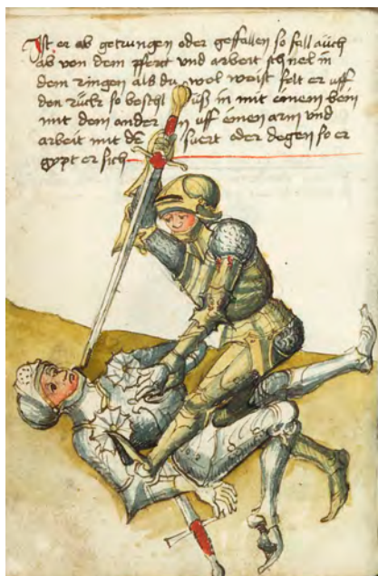
Figs. 7 (left) and 8: Unknown Augsburg book painter, Unhorsing an Opponent (left) and Subduing an Opponent , from Peter Falkner, The Art of Knightly Defense , Vienna, Kunsthistorisches Museum, KK 5012, fols. 72r-v.

The violent and fragmentary depiction of two figures locked in combat on Thun folio 12r bears a striking resemblance to the final illustration of a fight book written in the 1490s by Peter Falkner, a fencing master and captain of the illustrious guild of swordsmen, the Marxbrüder or Brotherhood of Saint Mark (fig. 8). The Kunst zu Ritterliche Were , or The Art of Knightly Defense , includes instructional verses and illustrations on unarmoured fencing with a longsword and Messer (a single-edged sword), as well as foot combat with daggers, staves, shields, and clubs. 32 The treatise also describes strategies for fighting on horseback