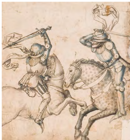
Fig. 5 (right): Unknown Artist, Study of Three Pairs of Combatants (detail), circa 1470s-1480s, ink and wash, Thun-Hohenstein Album, Prague, Uměleckoprůmyslové museum v Praze, GK 11.572-B, folio 10v.

Like the figures who grapple on the facing page, these cavalymen parallel the illustrations that populate contemporaneous fight books. Once again, Talhoffer's fight book from 1467 offers analogous content with striking stylistic parallels. Although the mounted swordsmen who gallop across the Munich manuscript's pages do not wear leg armour, their clothing and war hats echo those worn by the Thun riders. Furthermore, their grisaille forms and inky outlines recall the style of the Thun drawing. Talhoffer's personal manuscript, now in Copenhagen, offers additional comparative examples from the 1450s. This volume's illustrations of mounted grappling and of a mounted lancer and crossbowman each visualize figures whose clothing and armour resonate with the mounted swordsman in the Thun opening, down to the fabric-covered bevors that the figures in each illustration sport.