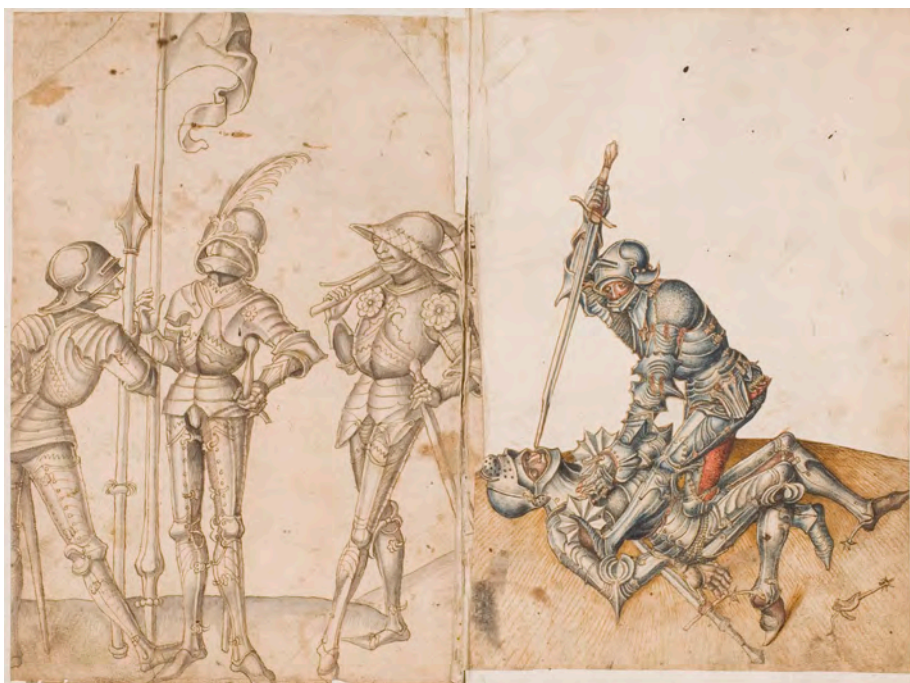
Fig. 22: Unknown Artists, Thun-Hohenstein Album, Prague, Uměleckoprůmyslové museum v Praze, GK 11.572-B, folios 11v and 12r

their armoured bodies. Along the page's trimmed left edge, a man leans away from the picture plane; his back turns toward the viewer and exposes the back sides of his pauldrons as they cascade over the raised, linear decoration of his backplate. This soldier extends his preternaturally long leg, revealing the hinges that close his cuisses and greaves, as well as the protective wings of his poleyns, or knee cops. A visored sallet protects his head, and a bevor covers his chin. This figure, whose back is turned to the viewer, leans on a spear as he grasps a barely visible sword in his left hand, carelessly resting its point on the ground. He seems to be in conversation with the image's central figure, whose sallet has no visor, but is crowned with a tall plume. The man holds a lance from which a banner flutters, but his gauntleted hand seems to grasp only air; the lance, apparently added after the rest of the drawing was composed, dissolves into transparency as its shaft meets the more substantial figure.