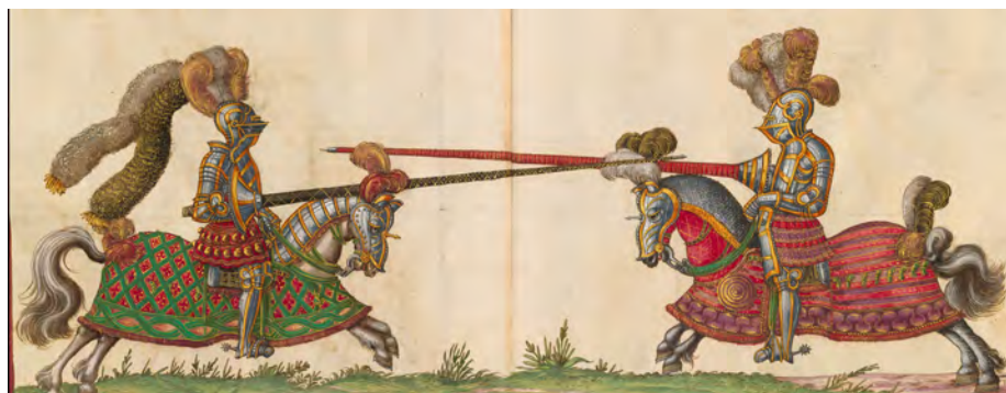
Fig. 17: Jörg Breu the Younger, The Joust of War in Armets , from Paulus Hector Mair, De Arte Athletica , Bayerisches Staatsbibliothek, Cod. icon. 393.b, folios 106v-107r

sum of 800 Gulden. 75 This work, almost entirely illustrated by Breu the Younger himself, uses layers of metallic washes to evoke the iridescent surfaces of blued steel armour and weapons. The sections on mounted combat in armour, in particular, use veils of metallic wash to vividly approximate the plate armour for which Augsburg was famous (fig. 17). Their shimmering, closely observed visualizations of the armoured body parallel the roughly contemporary sixteenth-century drawings that the Thun album collects. However, Breu the Younger's heavy layers of opaque pigments beneath the metallic washes differ markedly from the translucent application of pigments employed by both of the artists whose works comprise 101 of the album's 112 images.