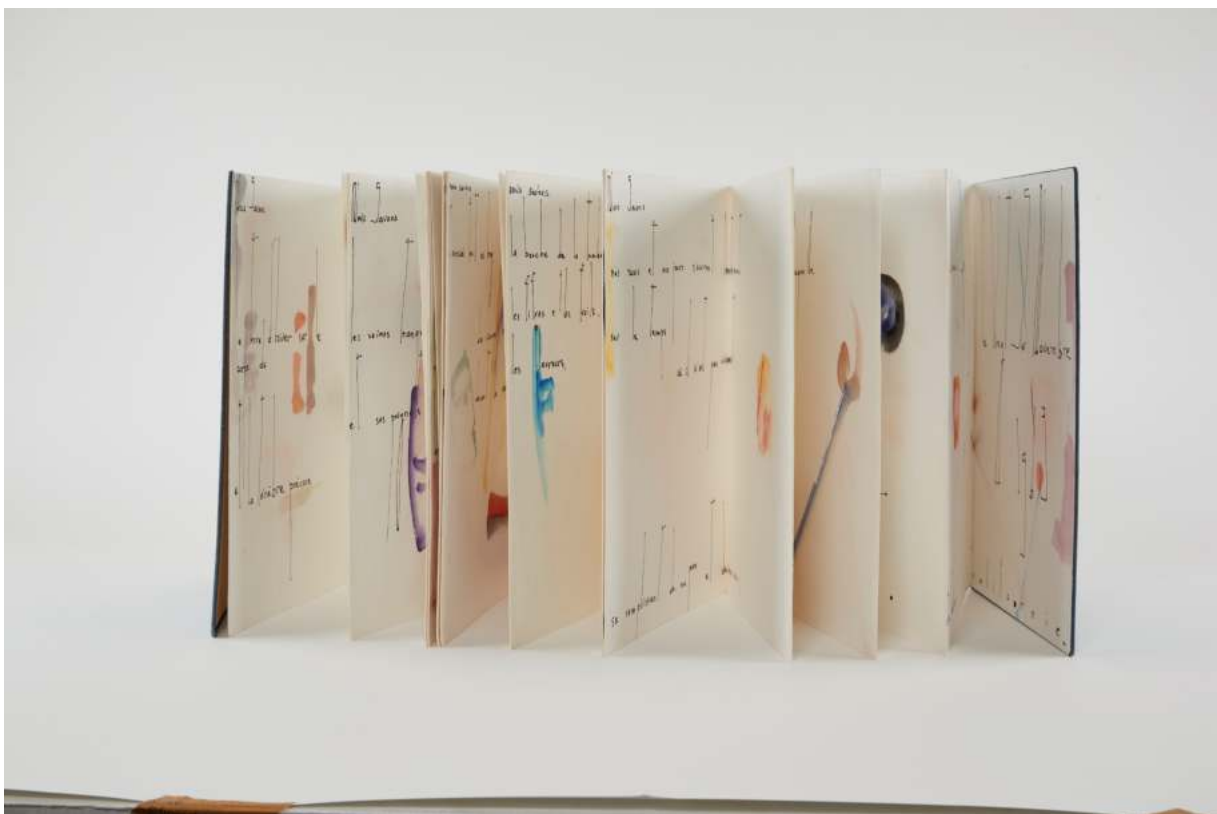
Figure 2: Etel Adnan, Wendell Berry, 26 November 1964, leporello, 1964. Exhibition at Zentrum Paul Klee, Bern, 15 June – 7 October 2018.

Adnan has a strong passion for Arabic poetry, including pre-Islamic poems. However, since her position is political, she "draws" only poems by contemporary authors, like the Palestinian Mahmoud Darwish, whom she knew personally and who translated some of her poetry and of whom she says he was "constantly close ... to the existential." 22