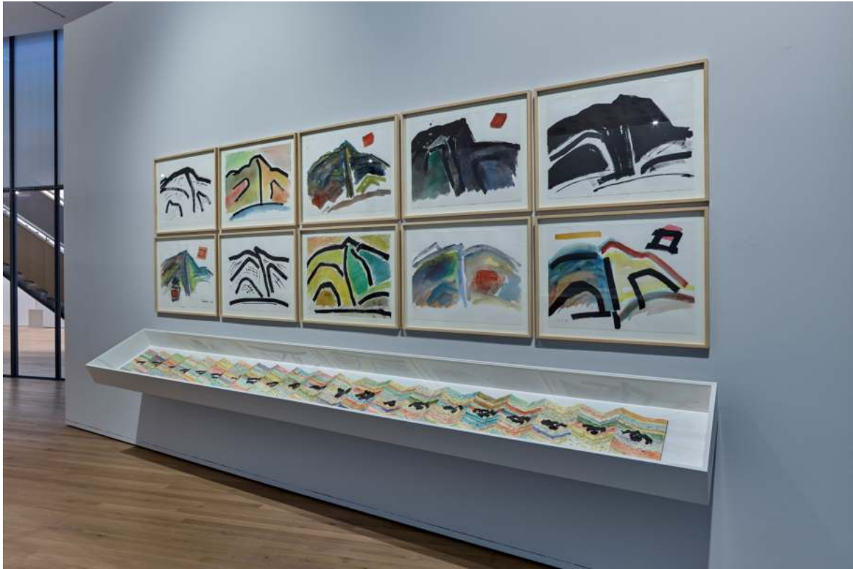
Figure 1: Etel Adnan, The Mountain, series of ten drawings, watercolor and china ink on paper, 2014 (display on wall). Etel Adnan, Journey to Mount Tamalpais, watercolor and ink on paper, 2008 (leporello in display case). Exhibition at Zentrum Paul Klee, Bern, 15 June – 7 October 2018.

Adnan's commitment against the war in Algeria led her to join the protest movement against the Vietnam War, as did many intellectuals in the United States at the time. Many were expressing their opposition against the war with their literary work, and so did Adnan, in her first poem in English, "The Ballad of the Lonely Knight in Present-Day America," which was published in the ephemeral S. B. Gazette in 1965. She now had two new languages, painting and English, in which she could express herself.